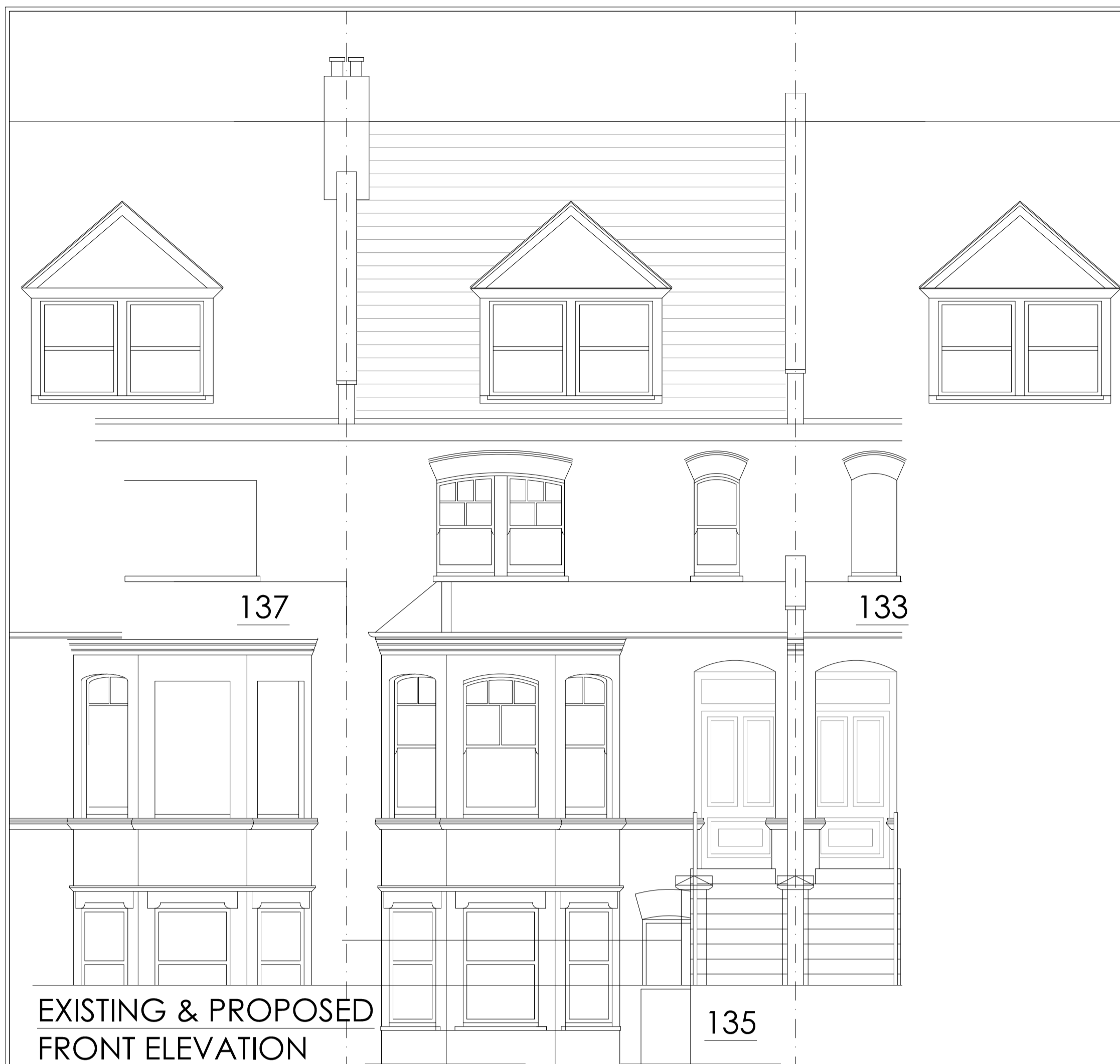
EXISTING & PROPOSED FRONT ELEVATION