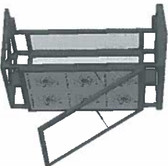
ADVERT DOOR OPEN