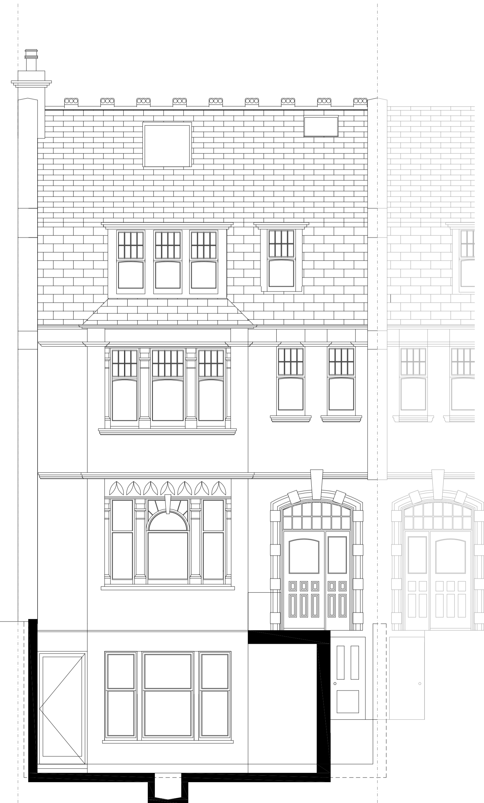
01. EXISTING FRONT ELEVATION/SECTION CT THROUGH LIGHT WELL