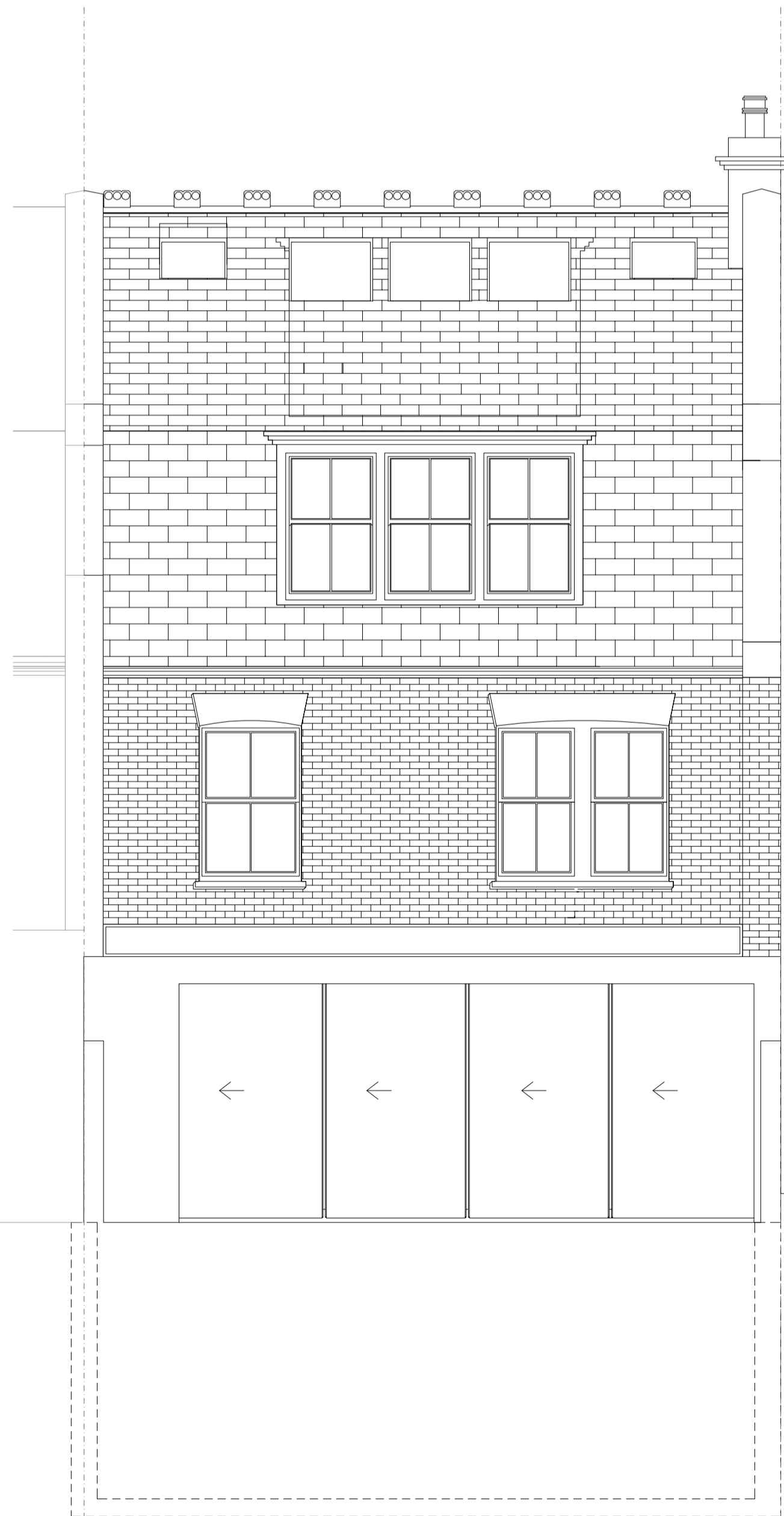
02. EXISTING REAR ELEVATION