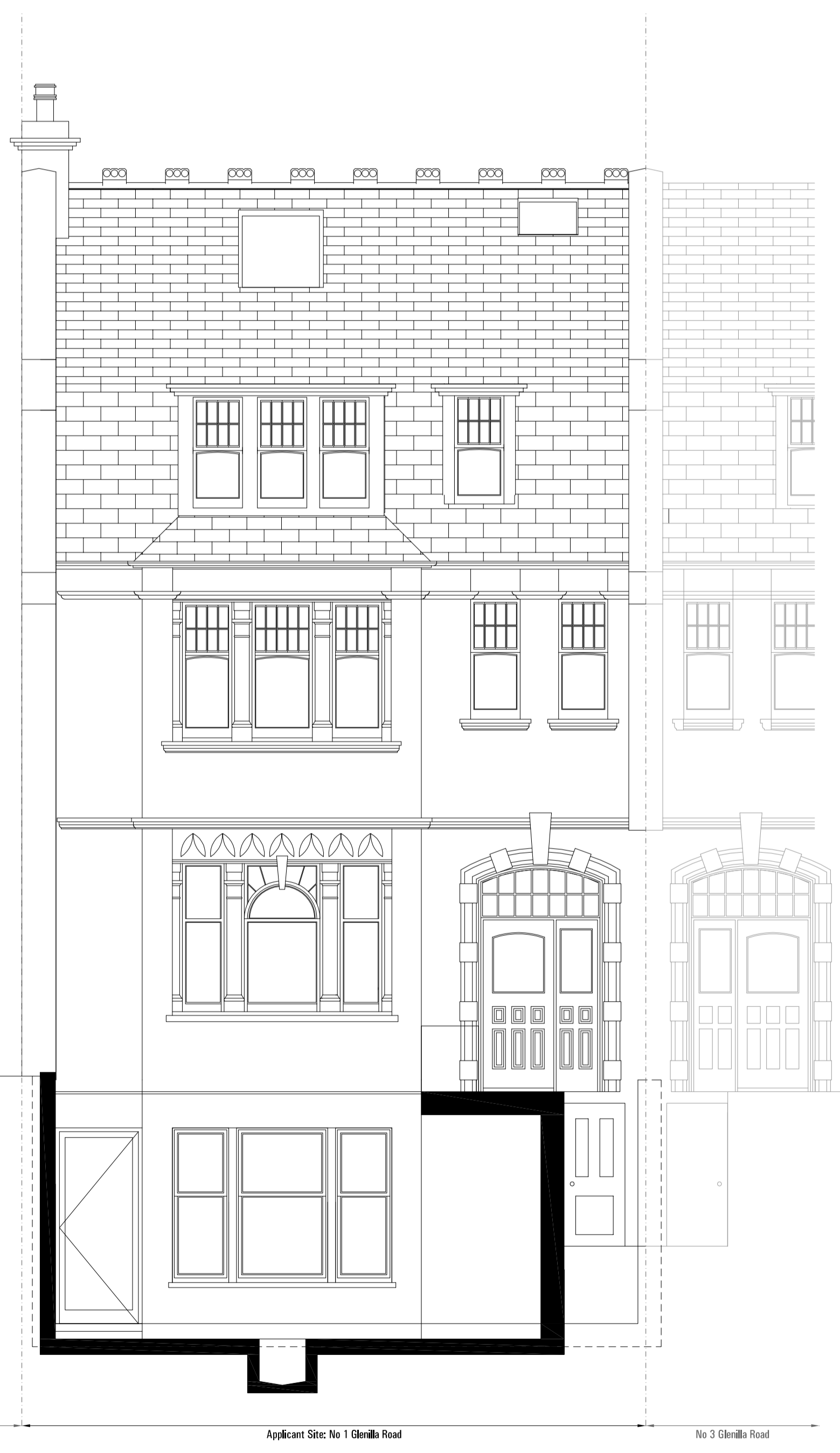
01. PROPOSED FRONT ELEVATION/ SECTION CUT THROUGH LIGHT WELL