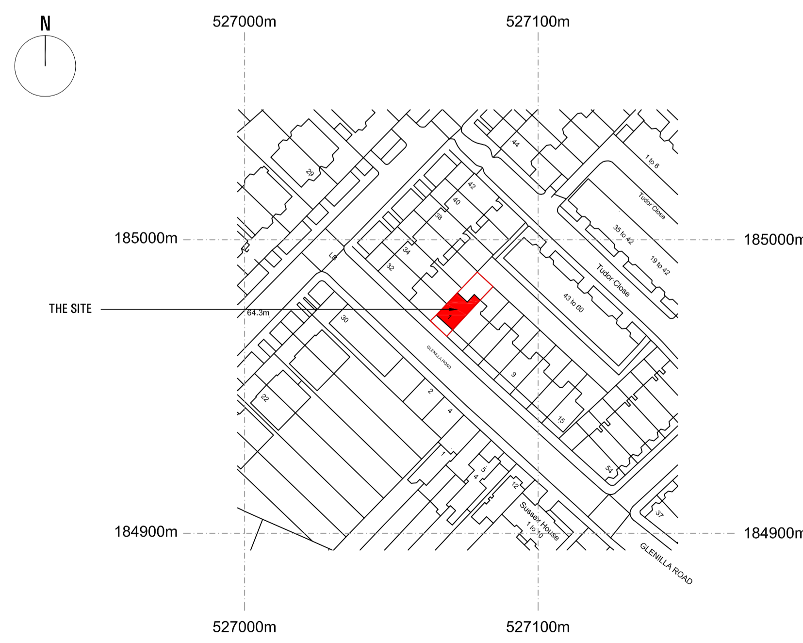
01. LOCATION PLAN 1:1250