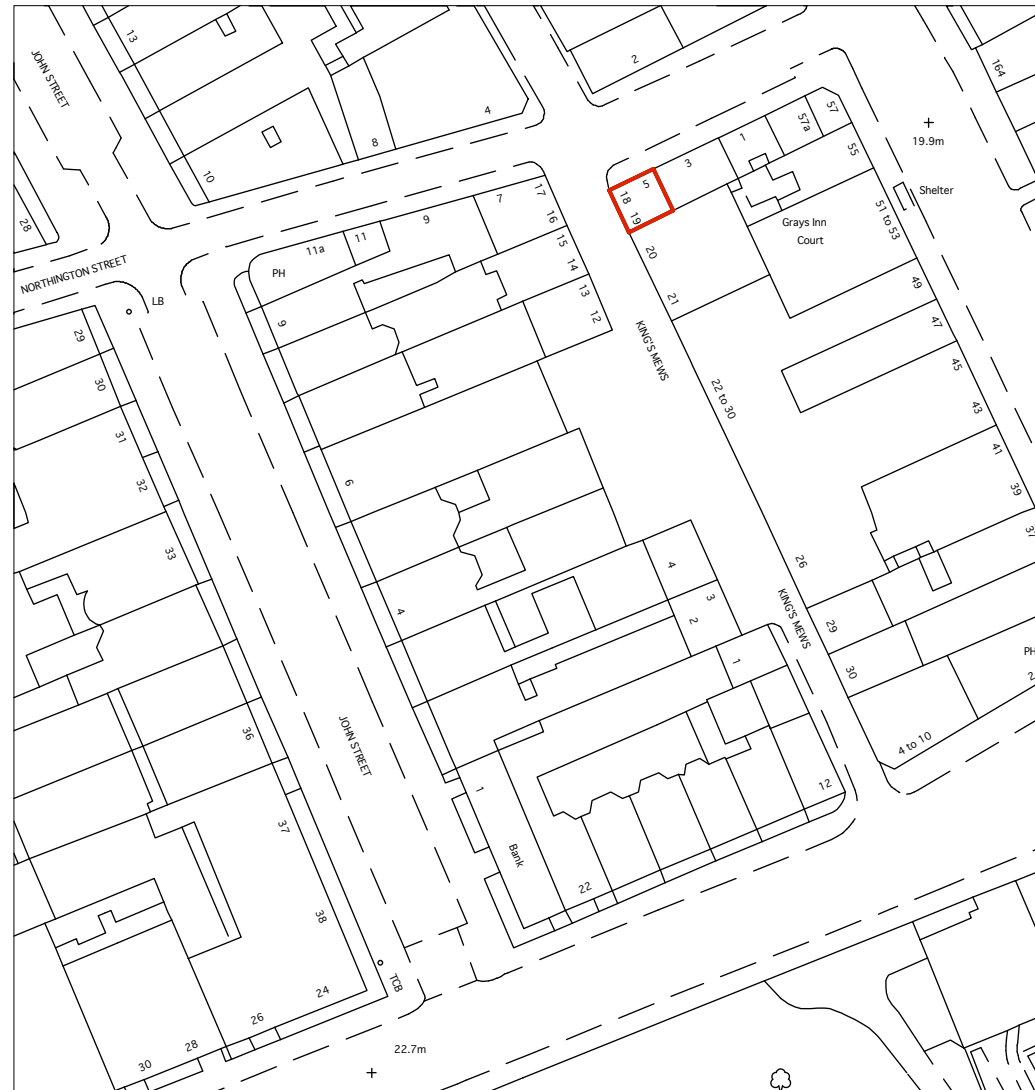
SITE PLAN Scale 1:1000@A3

GENERAL NOTES: DO NOT SCALE FROM THIS DRAWING. ALL DIMENSIONS MUST BE CHECKED ON SITE AND ANY DISCREPANCIES VERIFIED WITH THE ARCHITECT.