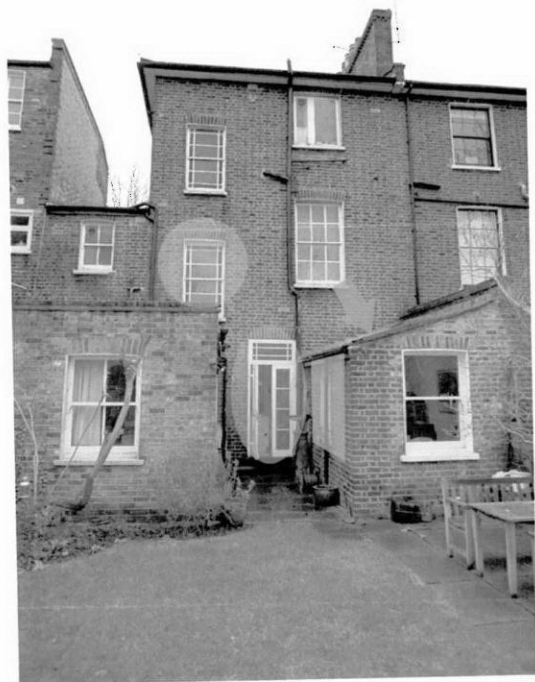
Communal staircase window at mid level