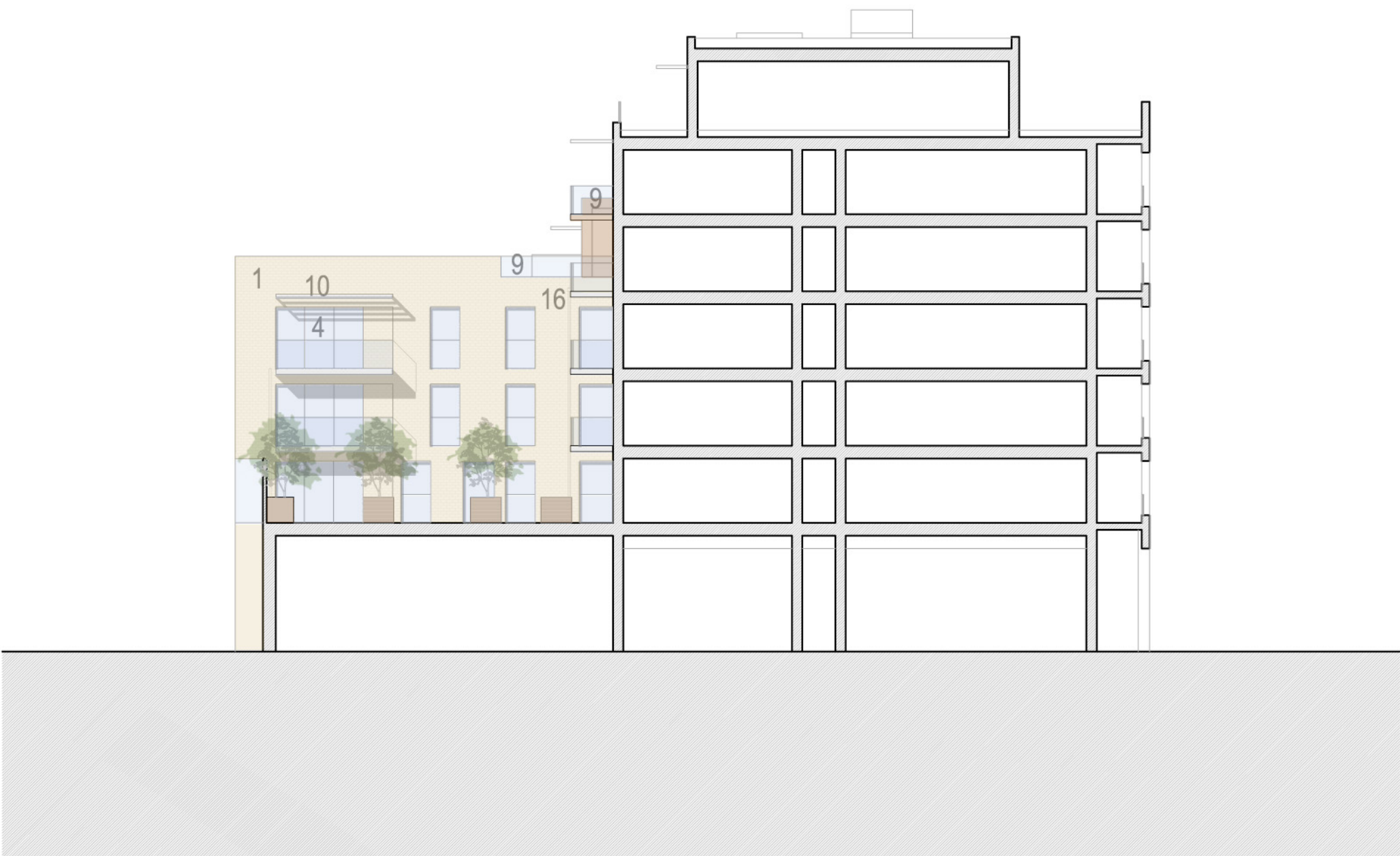
Proposed East Elevation facing roof garden