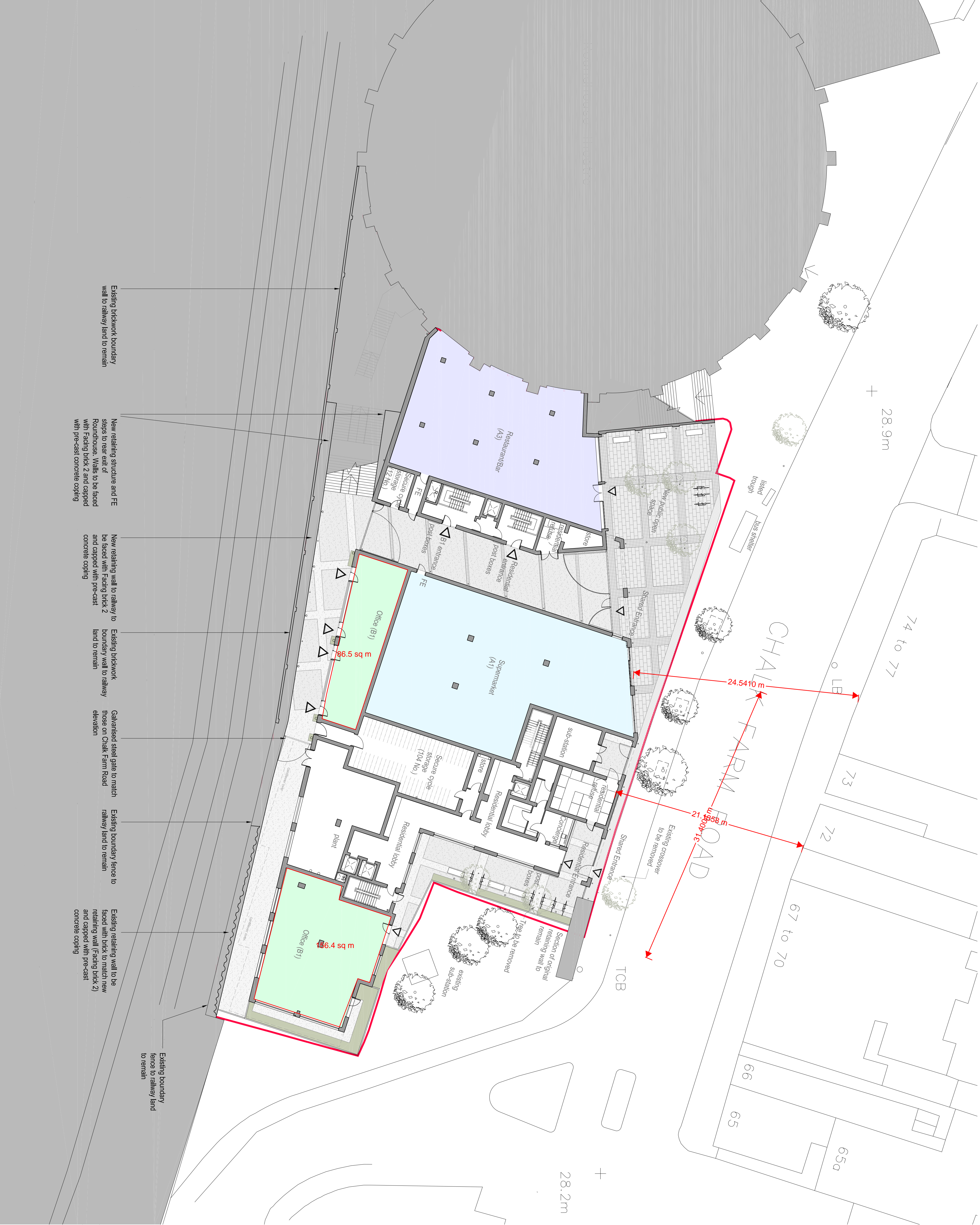
Site Layout and Ground Floor Plan - Level 0

Existing brickwork boundary wall to railway land to remain