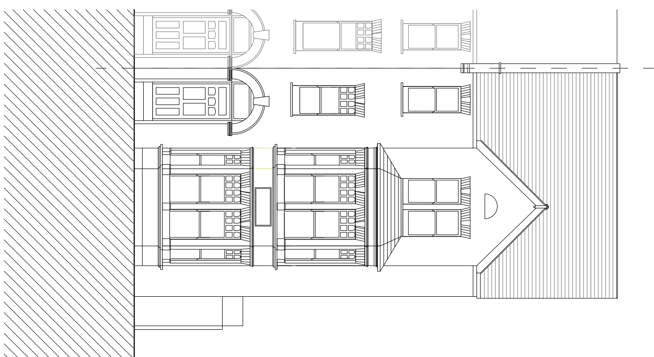
PROPOSED NORTH ELEVATION (street side elevation unchanged)

Drawn/ Rev Date Notes CA NA 19/11/13 NA NA DR D 27/03/14 NA NA