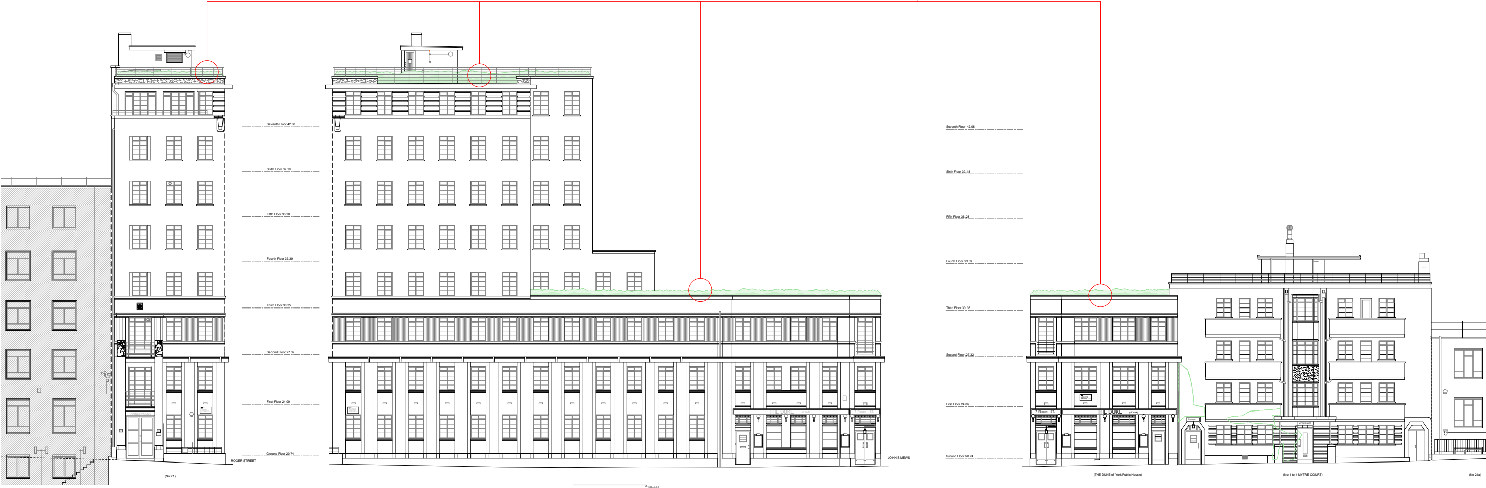
NORTH EAST ELEVATION (JOHN STREET) 1:250

lightweight planted border in troughs to provide privacy screening above existing parapet wall and railings