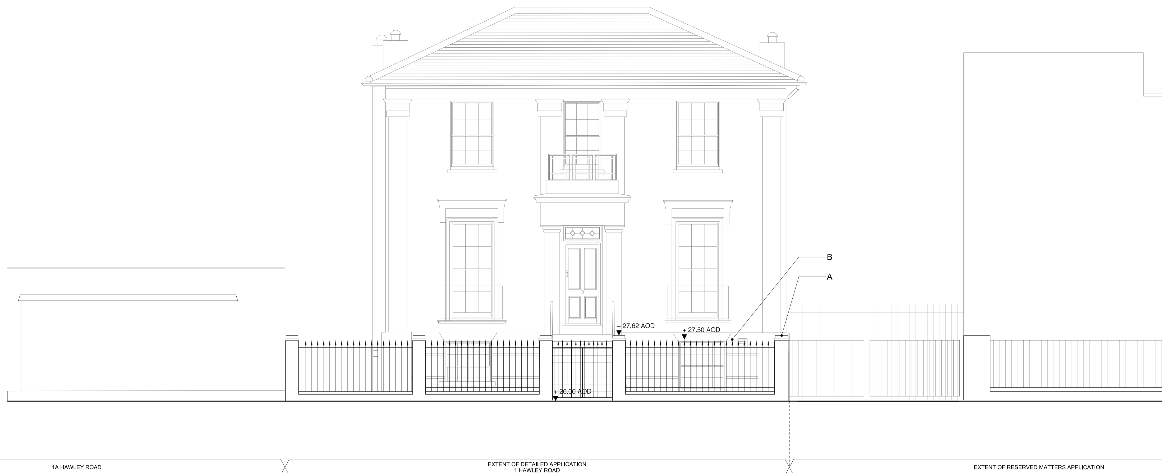
01 HAWLEY ROAD (NORTH) ELEVATION: GENERAL ARRANGEMENT