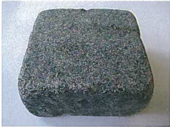
GRANITE SETS: UK STONE IMPORTS Dark Grey Flamed and tumbled natural edges