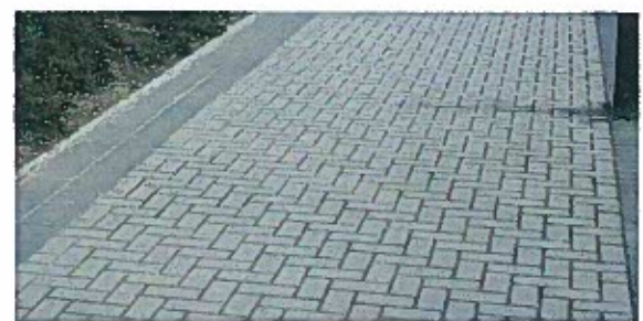
PAVING BLOCKS: KILSARAN Standard Slane Natural