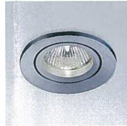
EXTERNAL LIGHTING: Ceiling recessed DELTA