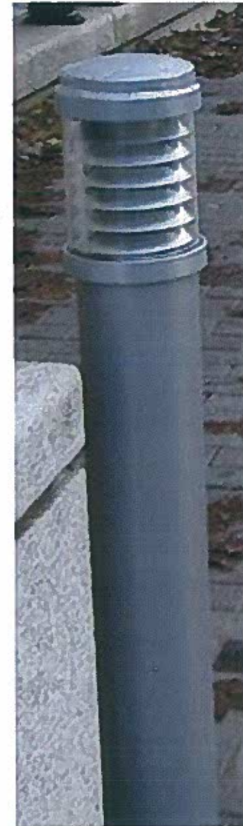
LIGHTING BOLLARD: DELTA

INFORMATION TO BE READ IN CONJUNCTION WITH DRAWINGS AND SCHEDULES