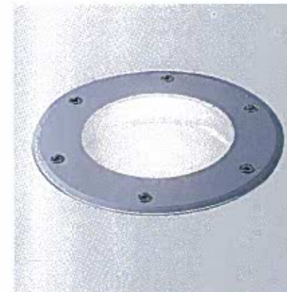
EXTERNAL LIGHTING: Floor recessed up-lighters DELTA