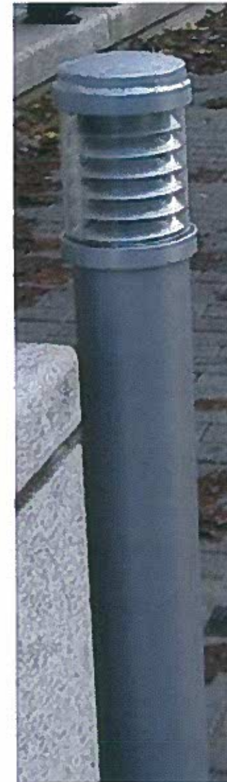
LIGHTING BOLLARD: DELTA

INFORMATION TO BE READ IN CONJUNCTION WITH DRAWINGS AND SCHEDULES