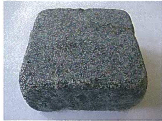
GRANITE SETS: UK STONE IMPORTS Dark Grey Flamed and tumbled natural edges