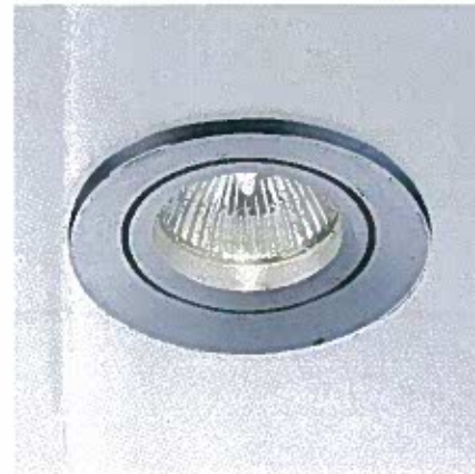
EXTERNAL LIGHTING: Ceiling recessed DELTA