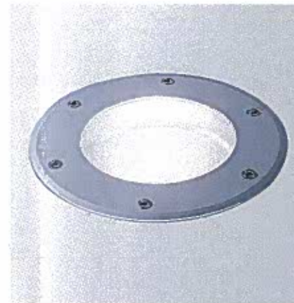
EXTERNAL LIGHTING: Floor recessed up-lighters DELTA