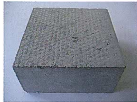
CONCRETE PAVERS: MARSHALLS Standard Pimple Paving Natural