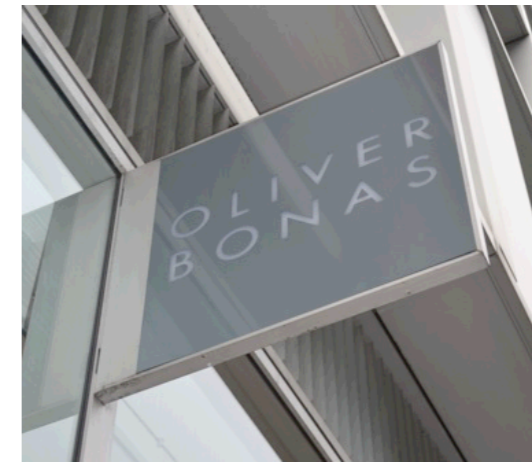
3 Visual of similar a sign