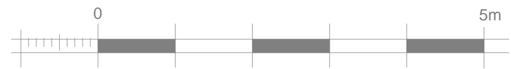
Proposed Roof Plan

kaplan interior design 14B ESSEX GROVE LONDON, SE19 3SX TELEPHONE +44 (0) 7508 420 537 hello@kaplaninteriordesign.com www.kaplaninteriordesign.com