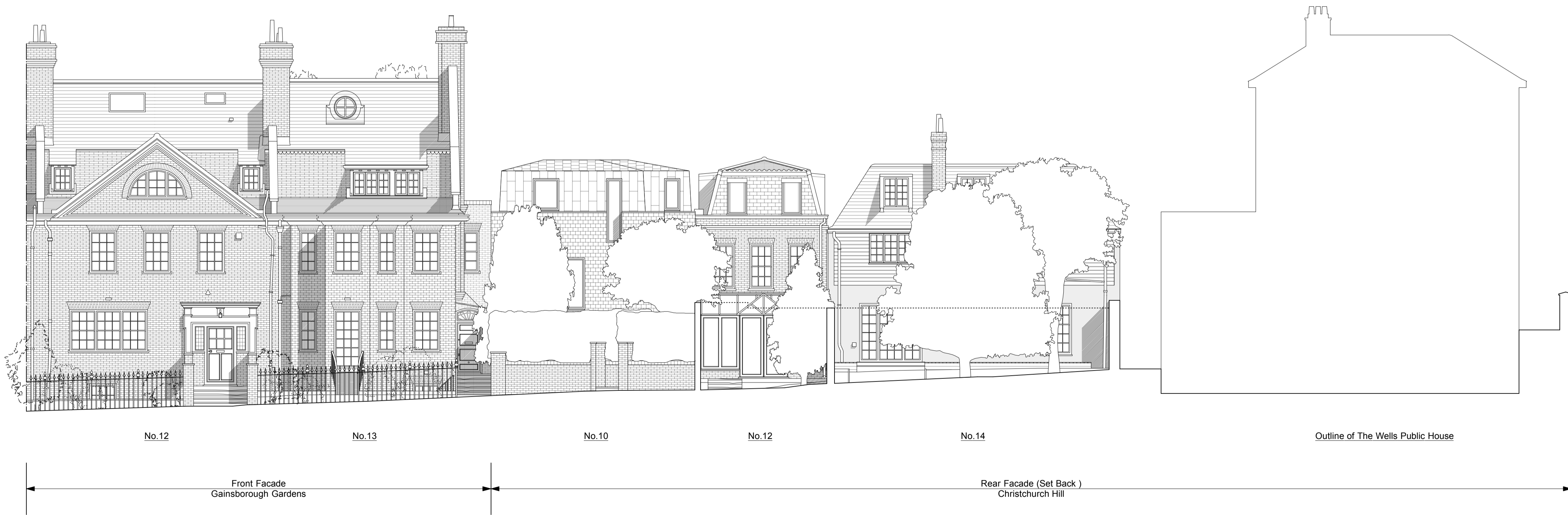
Proposed Rear Elevation Of Christchurch Hill & Front Elevation Of Gainsborough Gardens (D1)