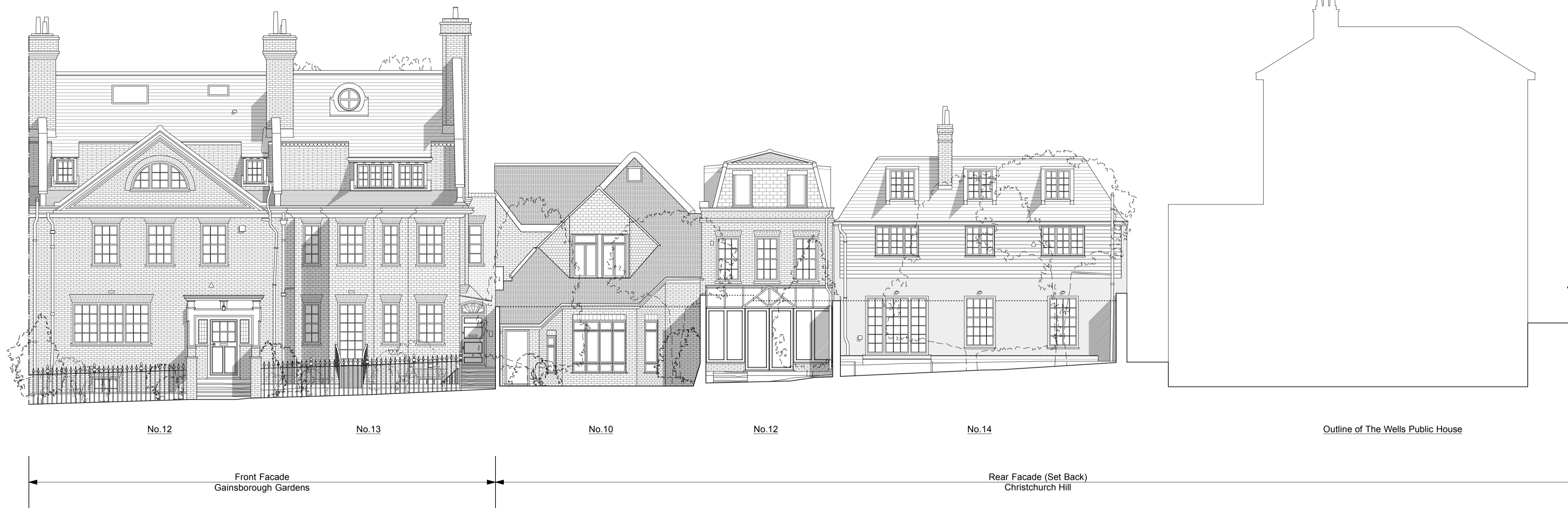
Existing Rear Elevation & Section Through Rear Gardens Of Christchurch Hill & Front Elevation Of Gainsborough Gardens (D)