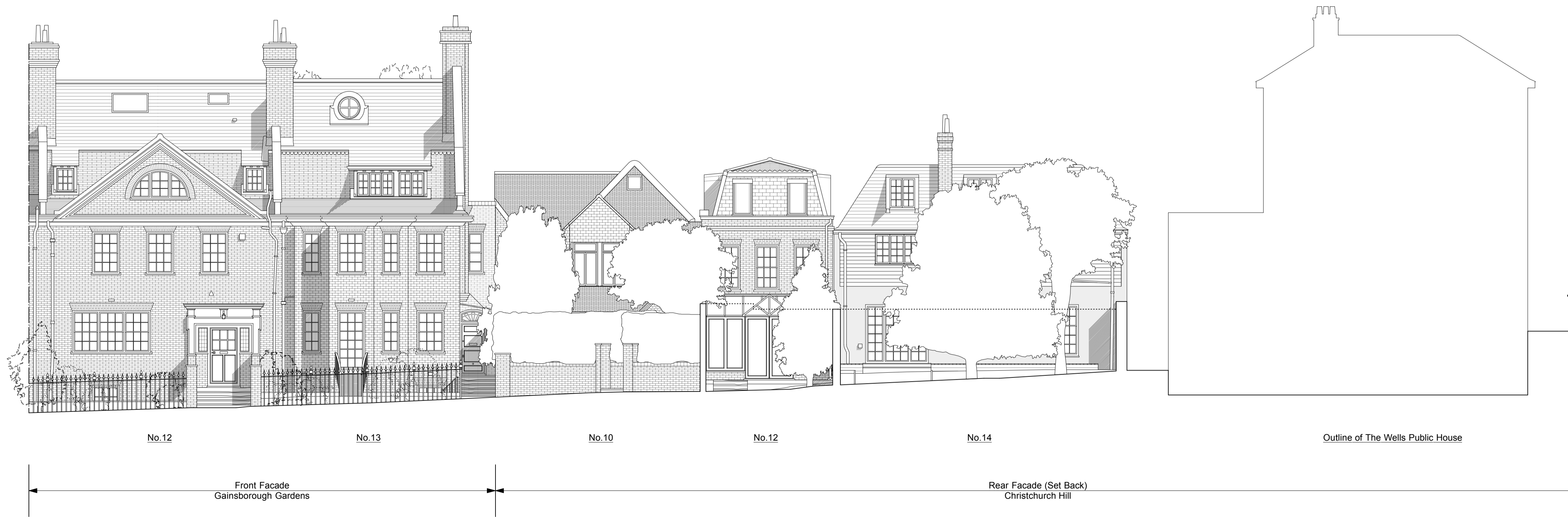
Existing Rear Elevation Of Christchurch Hill & Front Elevation Of Gainsborough Gardens (D1)