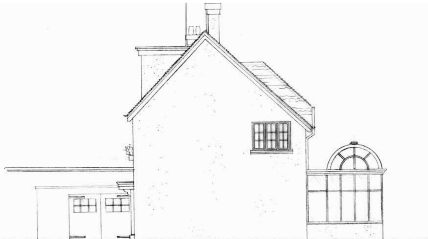
Existing West Elevation Scale 1:100