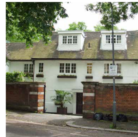
View from Lancaster Grove