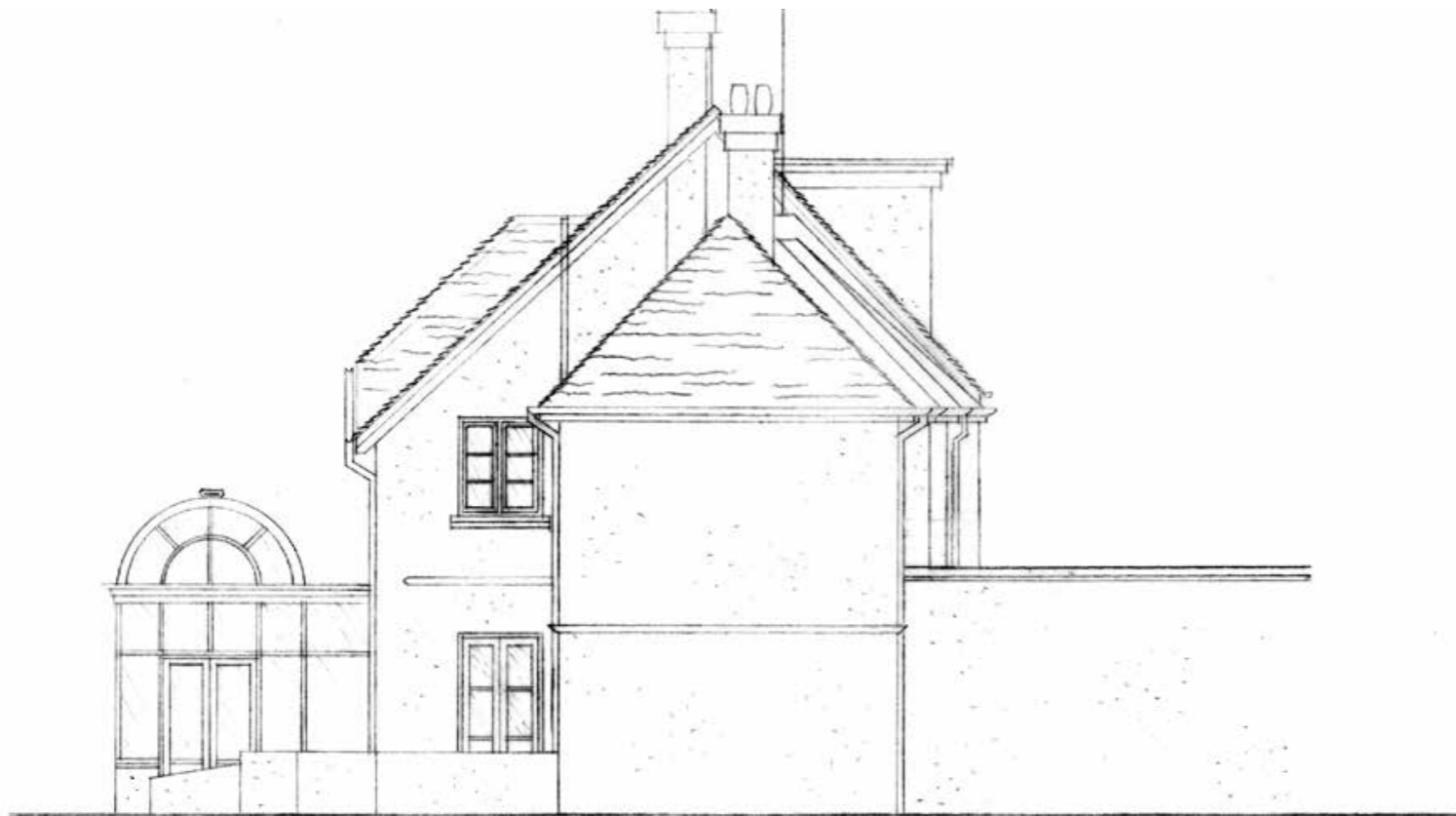
Existing East Elevation Scale 1:100