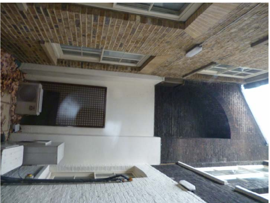
Rear Lightwell vaulted arch party wall