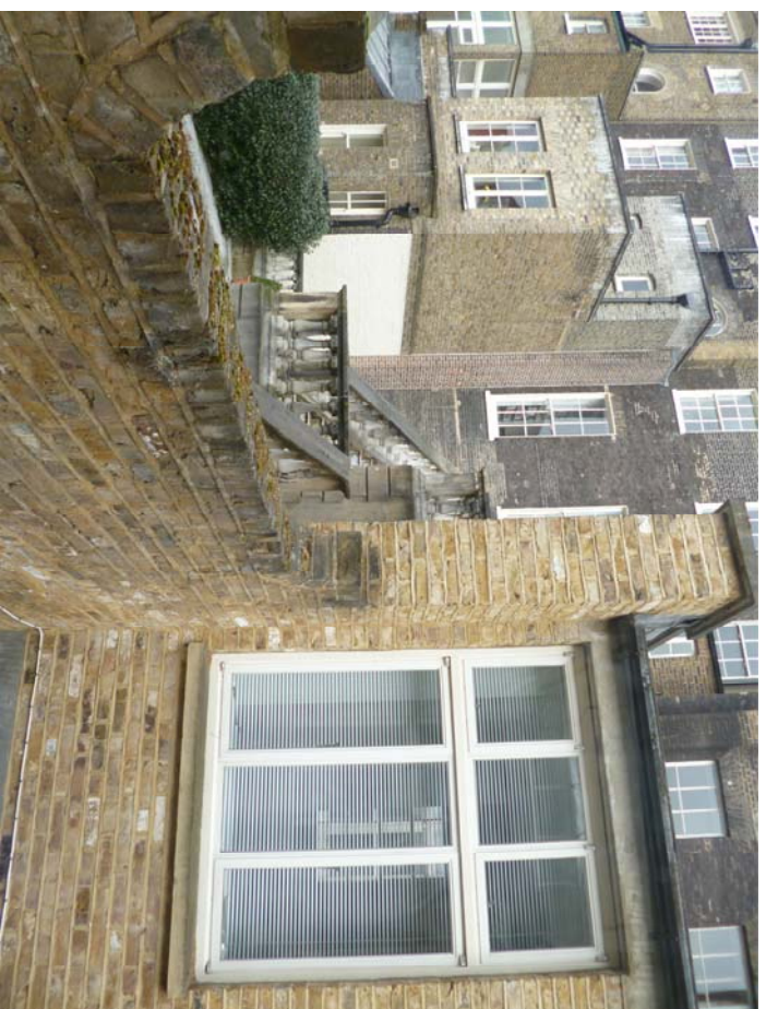
Existing party wall adjacent to rear courtyard