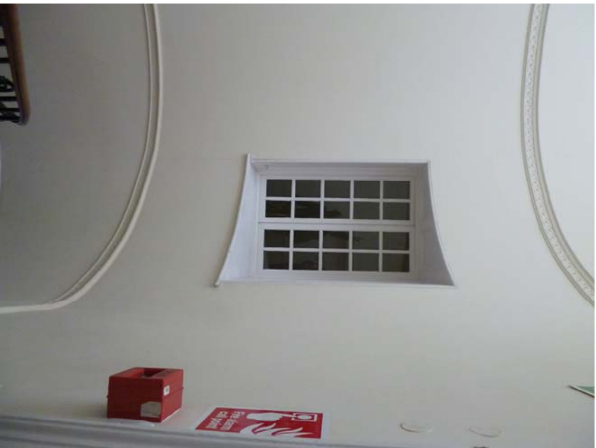
Stairwell window 2.01-x