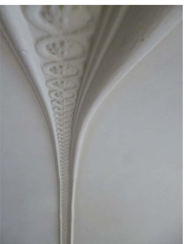
Second Floor stairwell