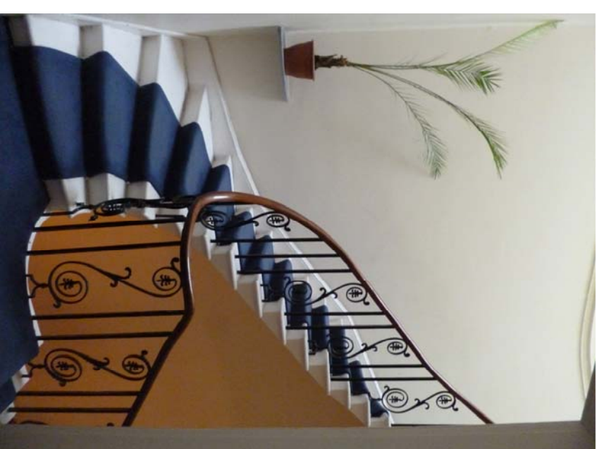
First floor landing 1.01-x