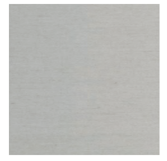
AluPlusPatina natural aluminium, mill finish, standard