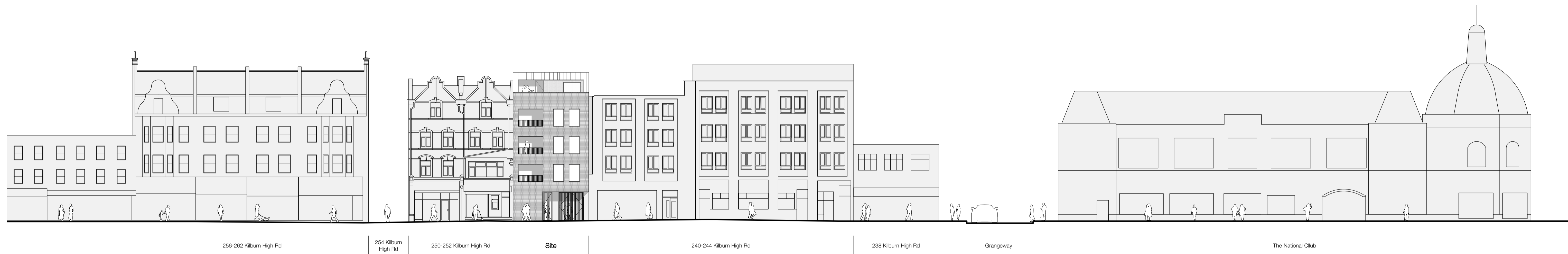
Kilburn High Rd Elevation