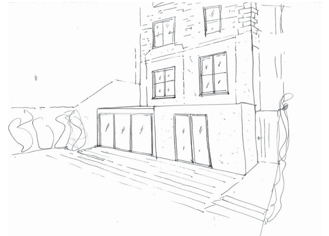
Artist Impression Enclosure/ Rear Extension