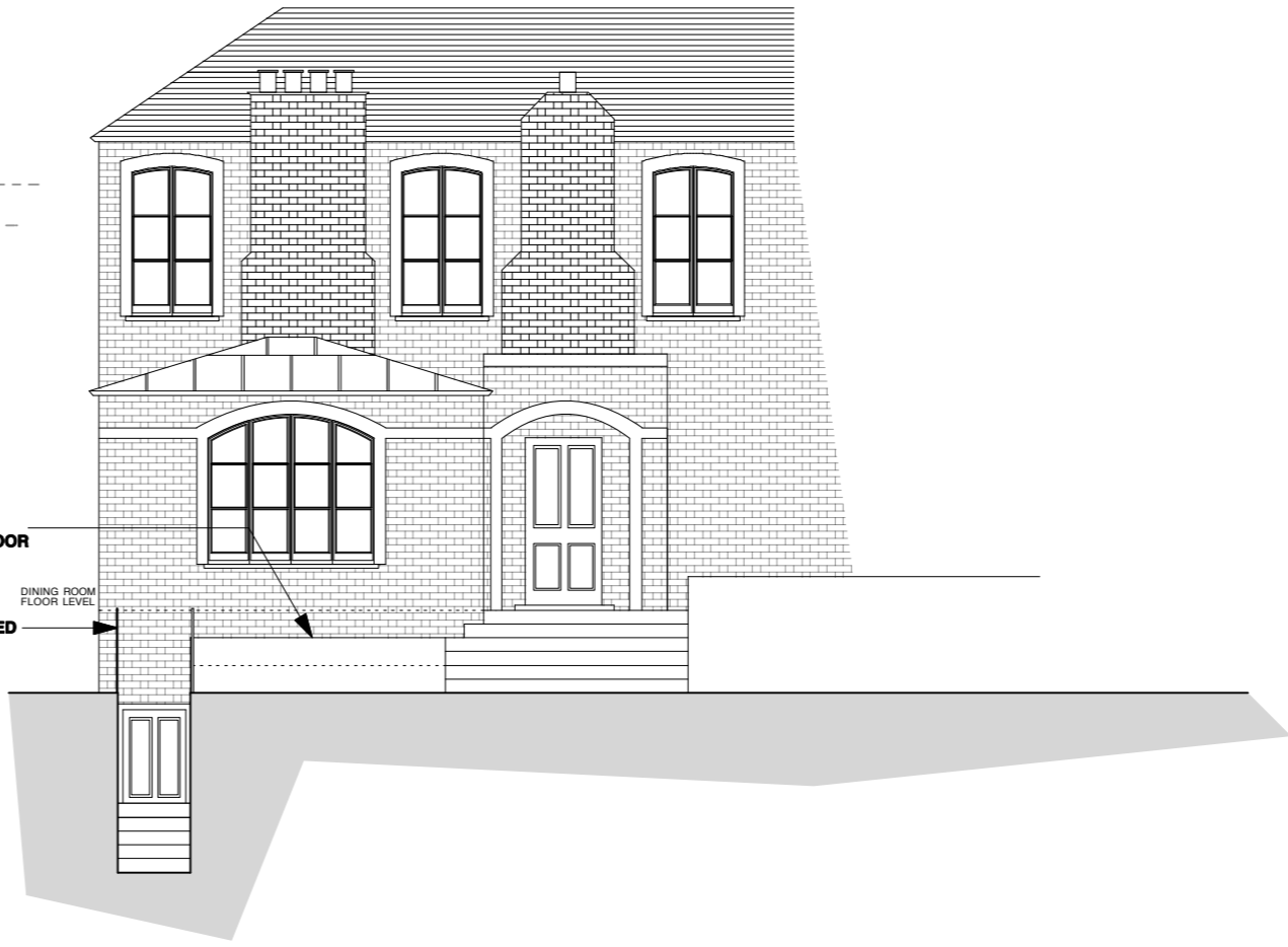
FRONT ELEVATION - PROPOSED 1:100@A3