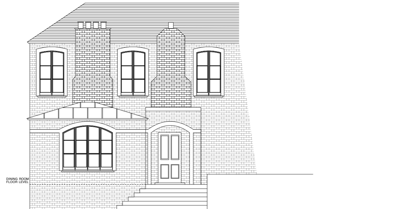
FRONT ELEVATION - EXISTING 1:100@A3