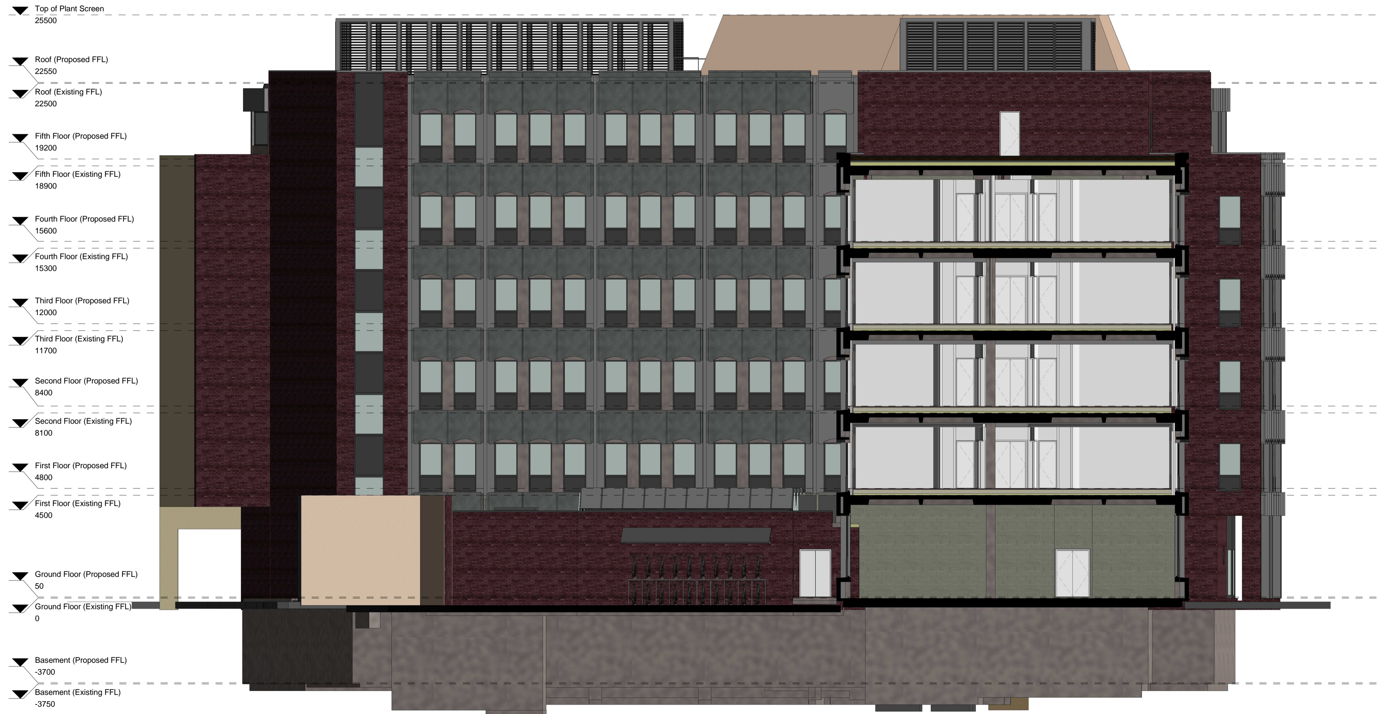
B SECTION B-B 1 : 100