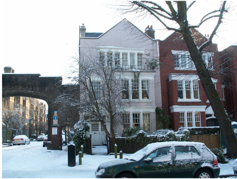
01_FRONT ELEVATION TO BELSIZE AVENUE

NOTE: DO NOT SCALE OFF THIS DRAWING CONTRACTOR TO VERIFY ALL DIMENSIONS ON SITE CROSS REFER TO ALL RELEVANT SPECIFICATIONS, SCHEDULES, DETAILS AND CONSULTANTS DRAWINGS THIS DRAWING IS BASED ON SURVEY INFORMATION BY OTHERS