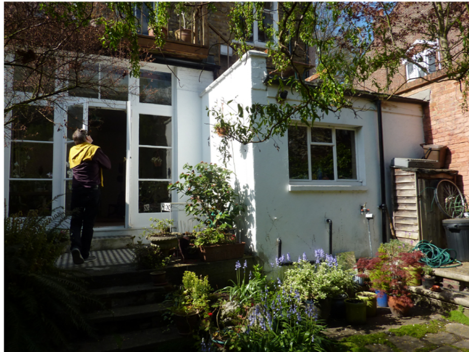
04_EXISTING REAR EXTENSION