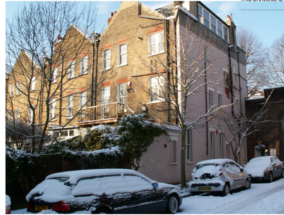
03_SIDE ELEVATION TO TUDOR CLOSE