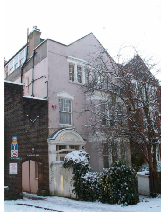
02_CORNER OF BELSIZE AVENUE AND TUDOR CLOSE