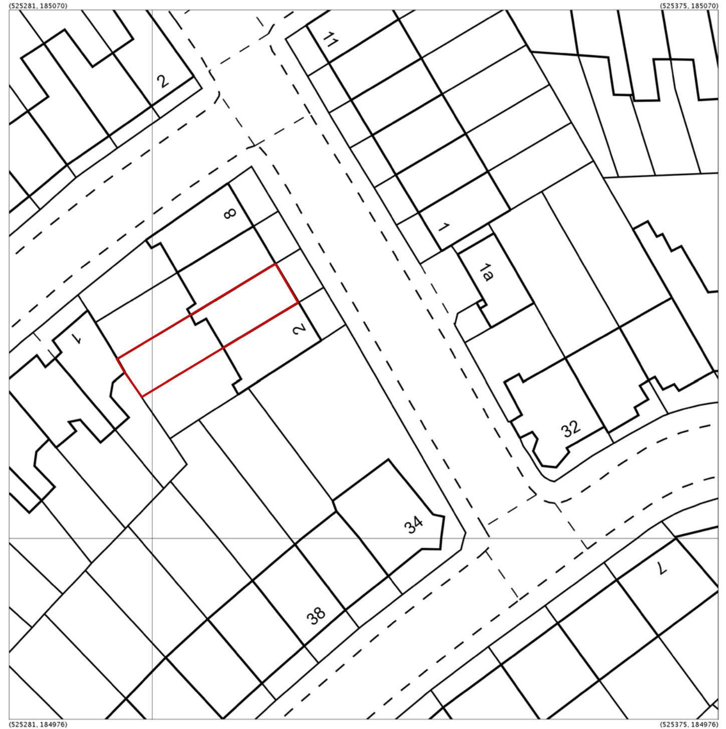
1:500 Block Plan