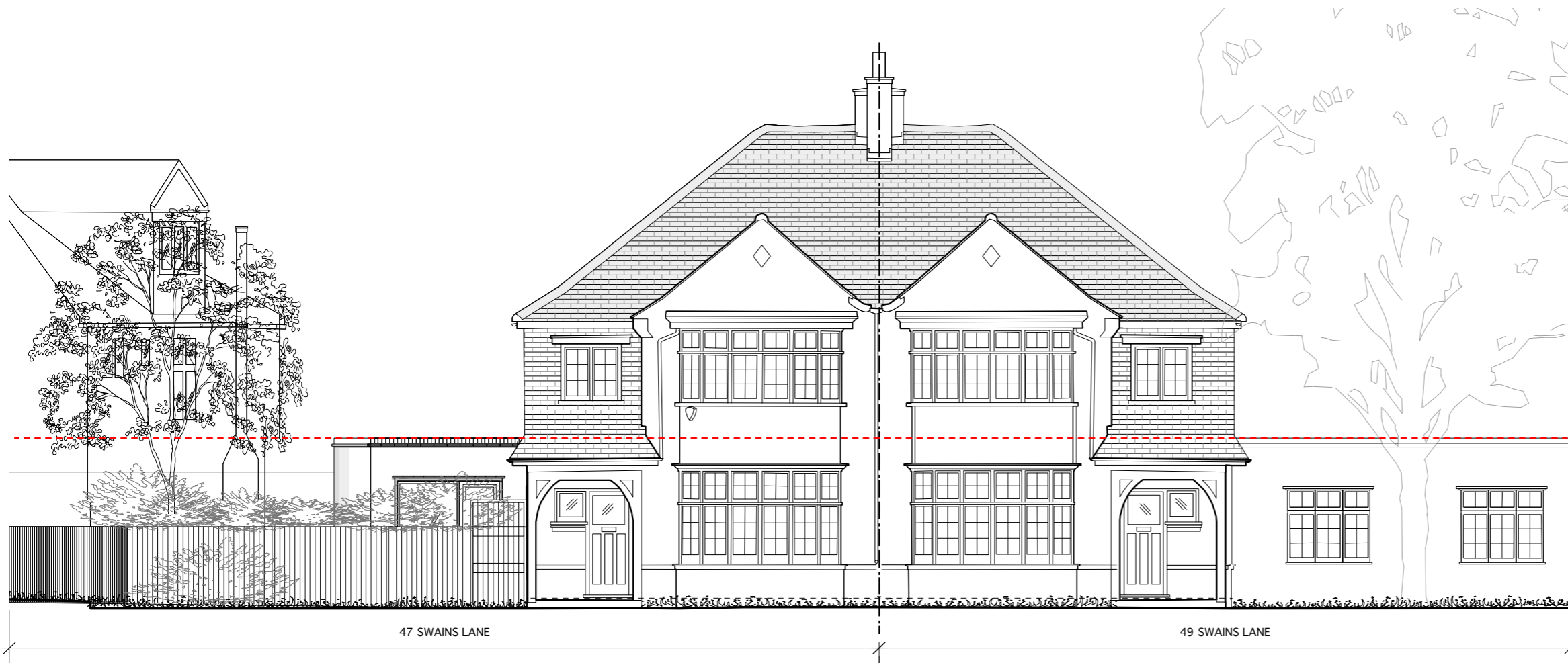
A STREET FRONT ELEVATION 210