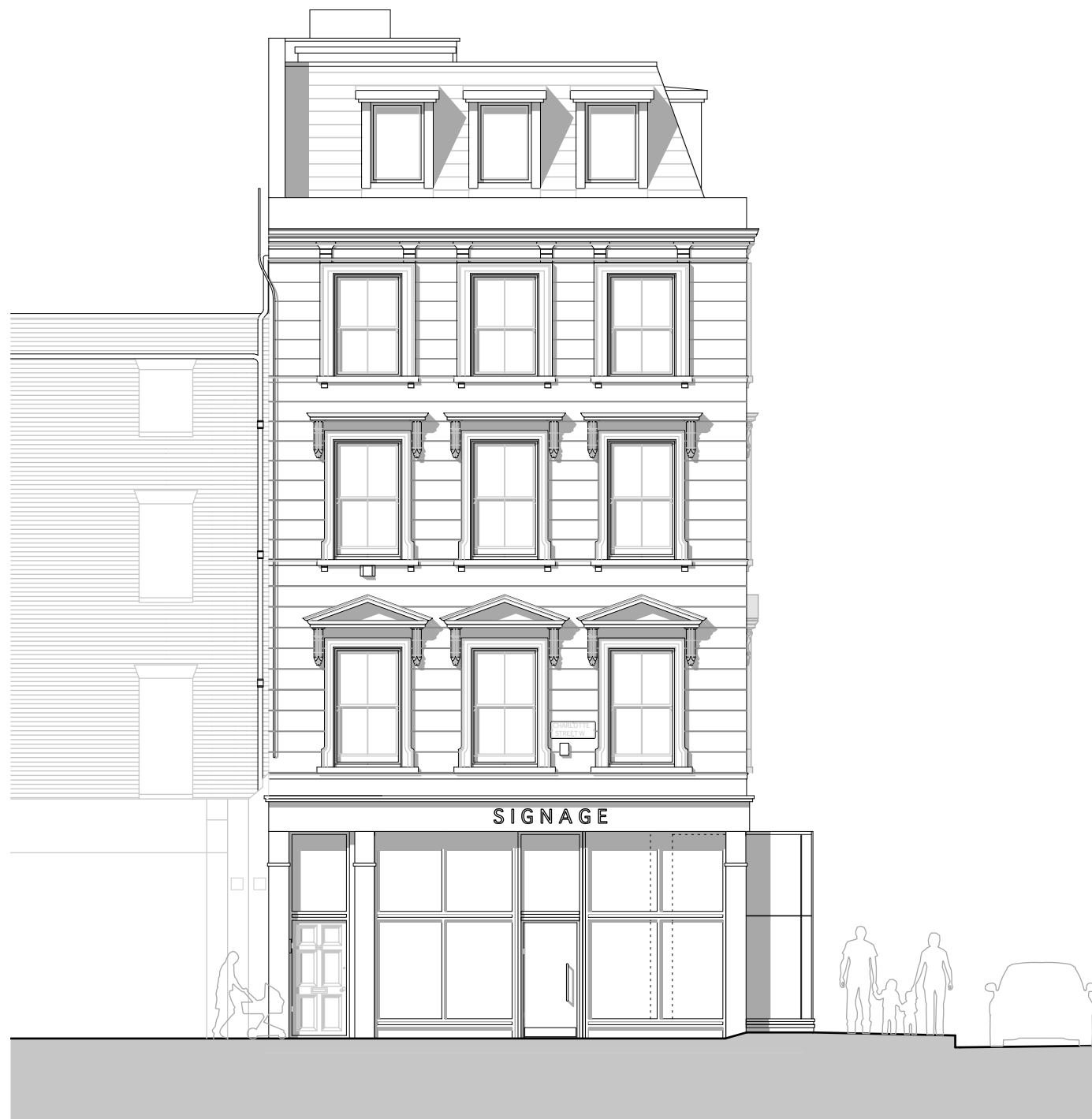
01 Elevation - Charlotte Street (east)