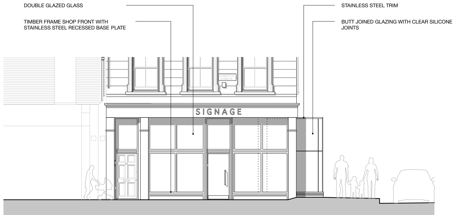
03 Proposed Elevation - Charlotte Street (east)