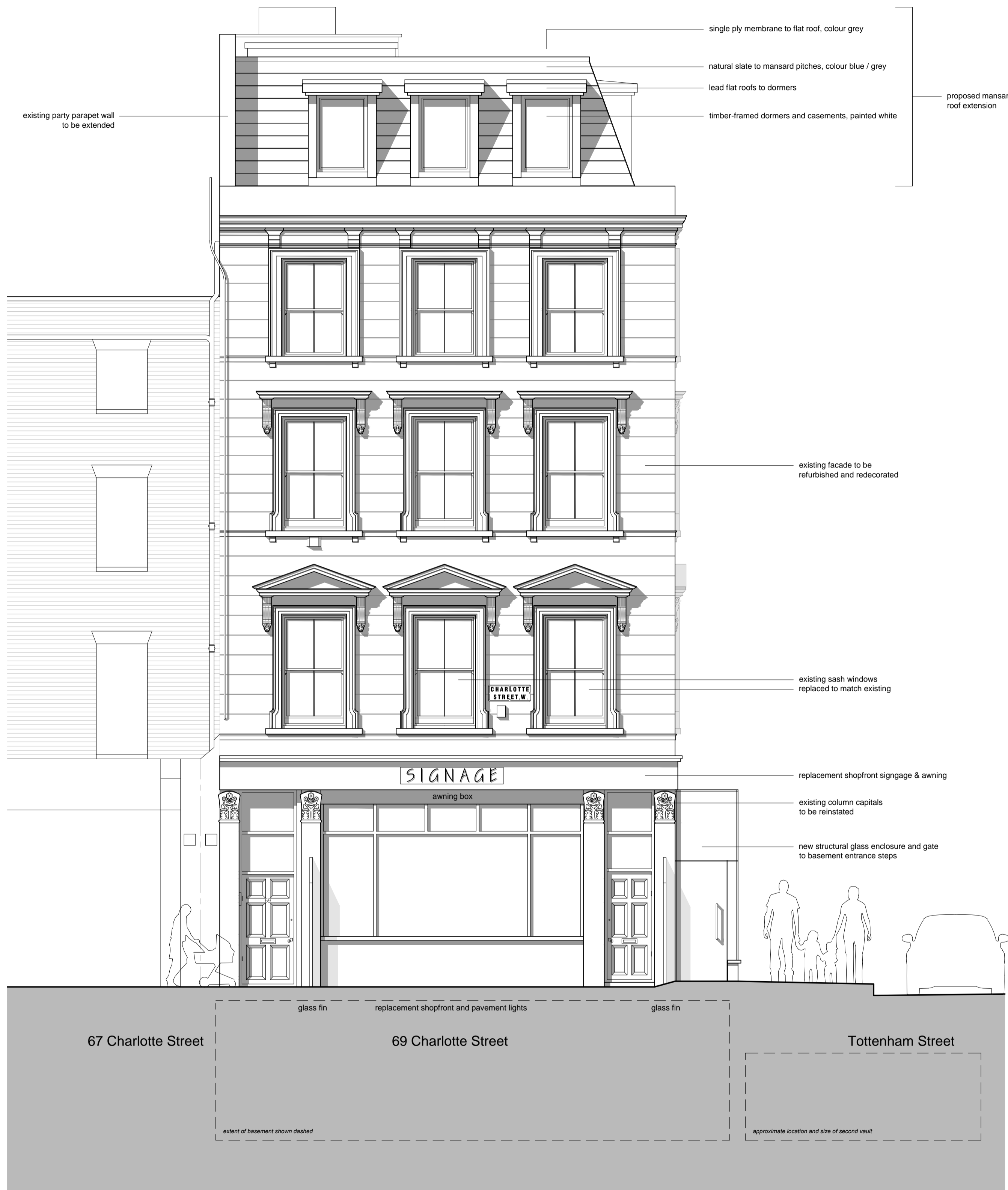
Charlotte Street Elevation (east)