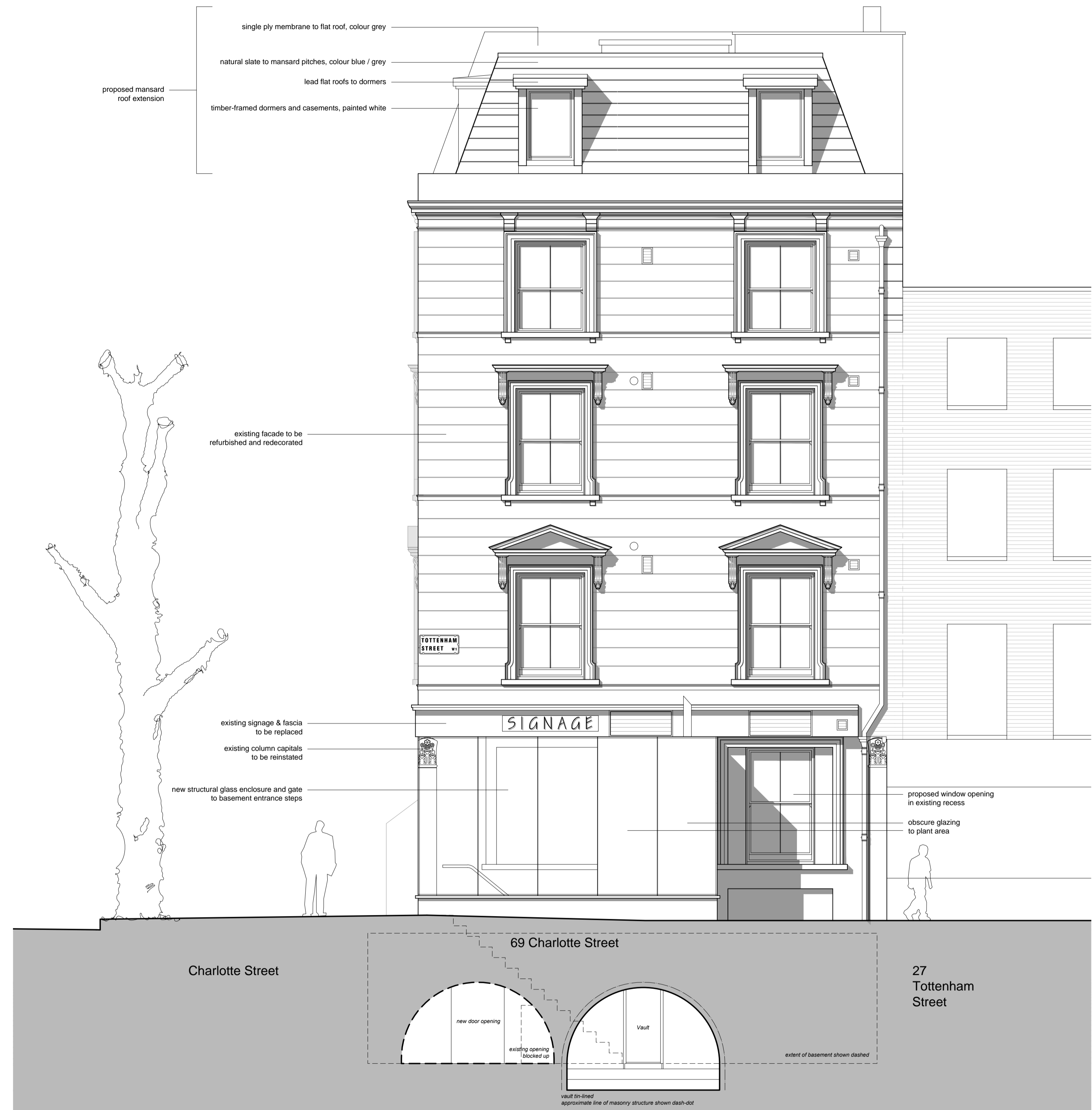
Tottenham Street Elevation (north)