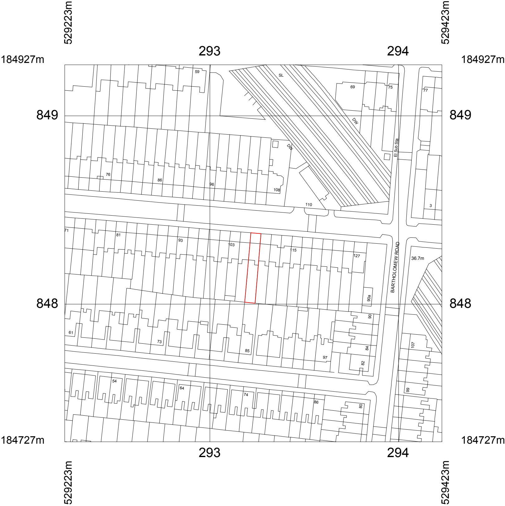
LOCATION PLAN 1:1250 @ A3