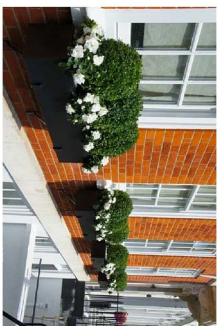
④CAST IRON RAILINGS/HANGING PLANTS