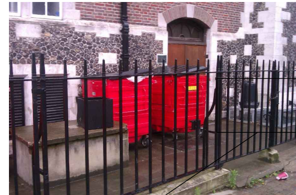
Existing external boiler plant in caged enclosures to be removed and replaced with new vents &amp; housing