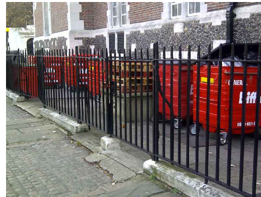
Existing Bin store area