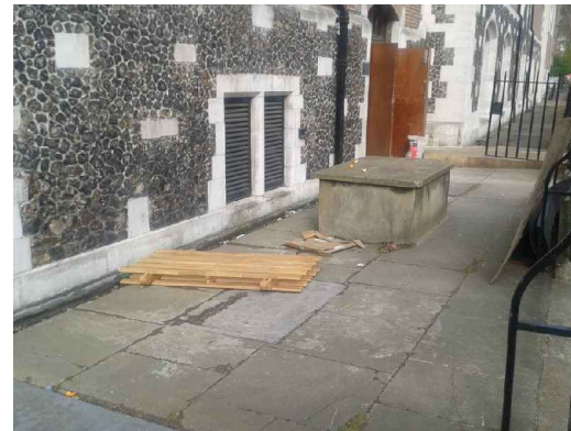
Existing concrete vent housing - to be removed