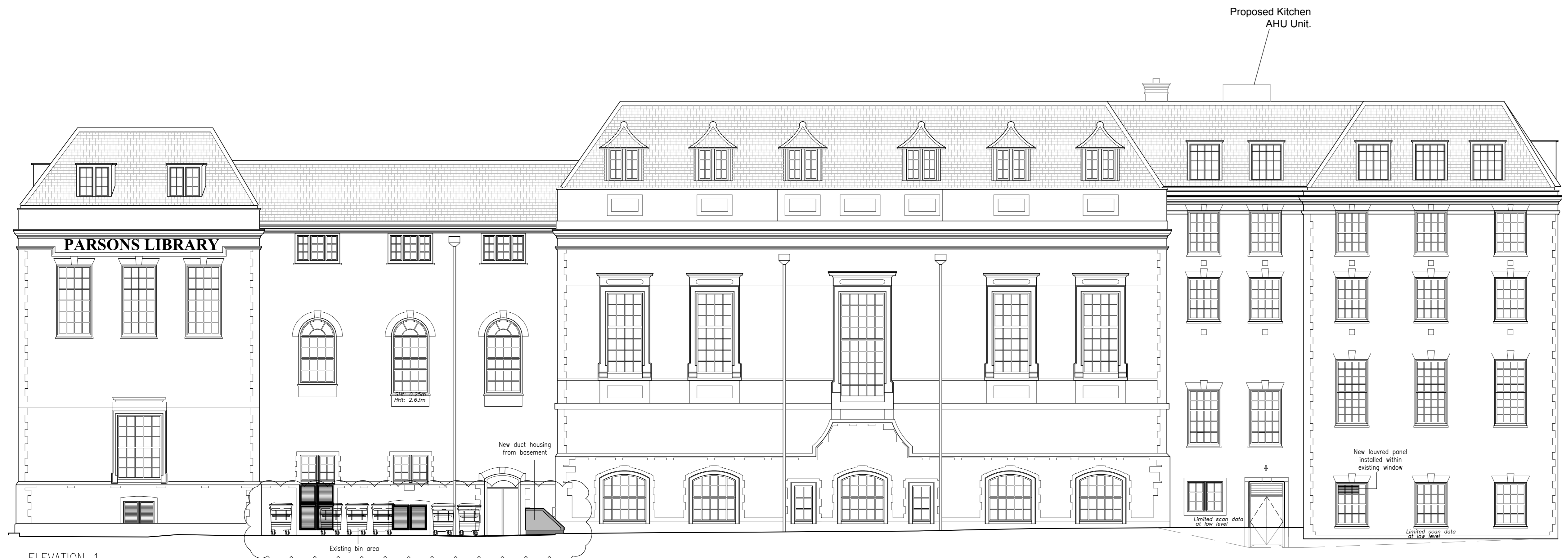
ELEVATION 1 EAST (Doughty Street) Elevation