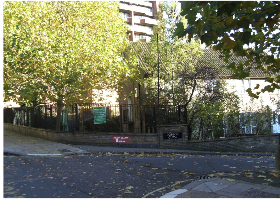
LOCATION WITHOUT POLE Corner of Belsize Road and Dobson Close.