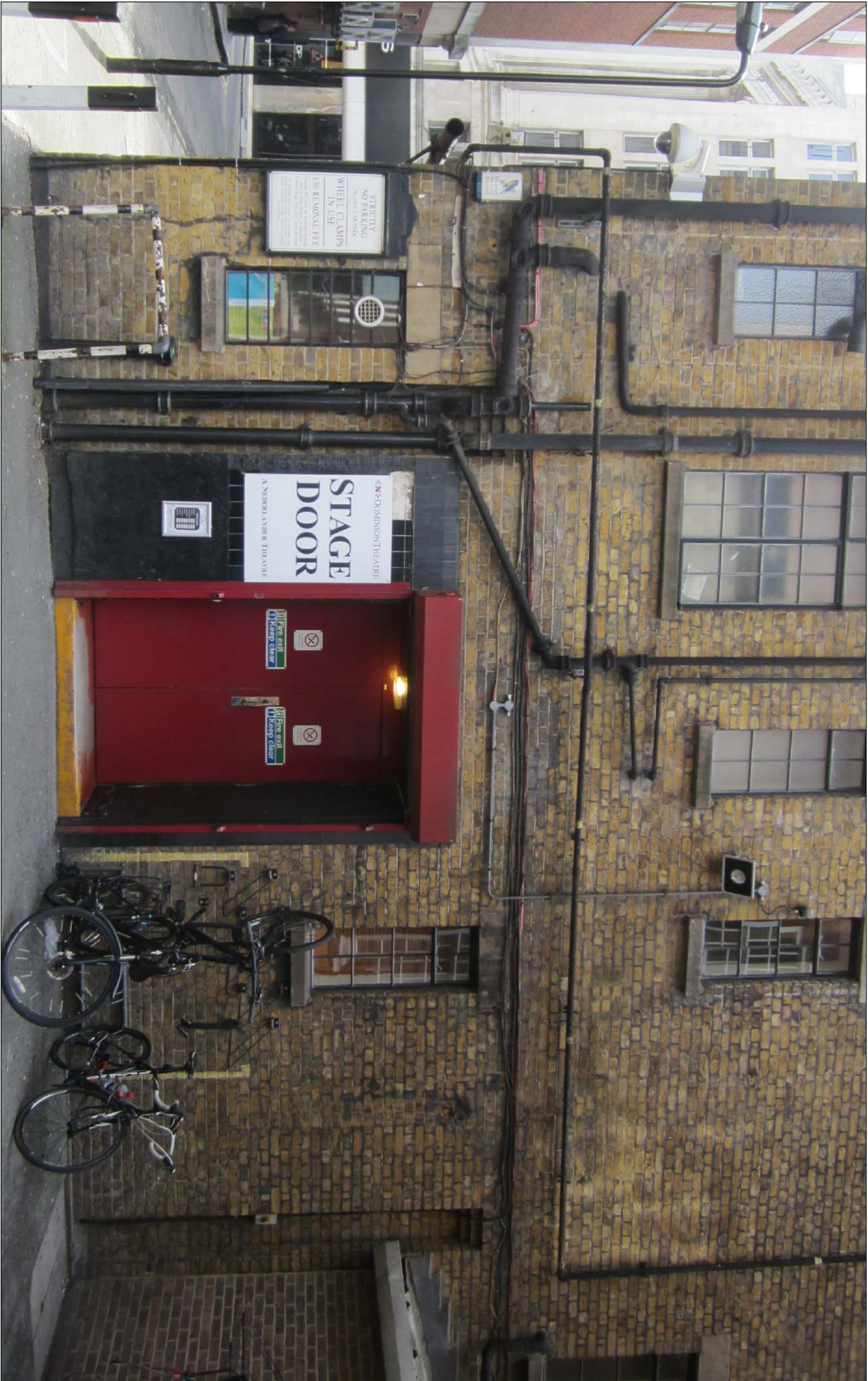
EXISTING ELEVATION SHOWING STAGE DOOR (SCALE 1:50 AT A3)

THIS DRAWING AND THE COMPUTER FILE OF THIS DRAWING ARE COPYRIGHT. THE COPYRIGHT BELONGS TO MICHAEL JACKSON CONSULTING ENGINEERS LIMITED (MJC LIMITED). THIS DRAWING MAY THEREFORE, NOT BE REPRODUCED IN ANY FORMAT WITHOUT THE WRITTEN CONSENT OF MJC LIMITED AND THE COMPUTER FILE MAY NOT BE TRANSFERRED WITHOUT THE WRITTEN CONSENT OF MJC LIMITED.