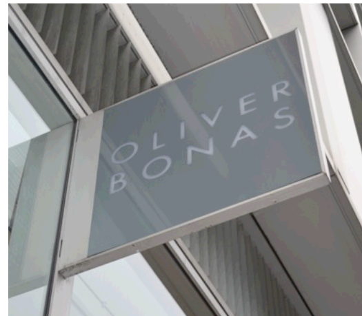
3 Visual of similar a sign