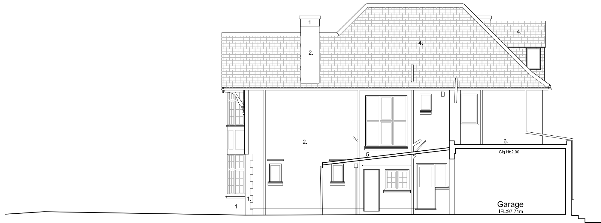
NORTH ELEVATION 1 1:100 @ A3 HIW - X