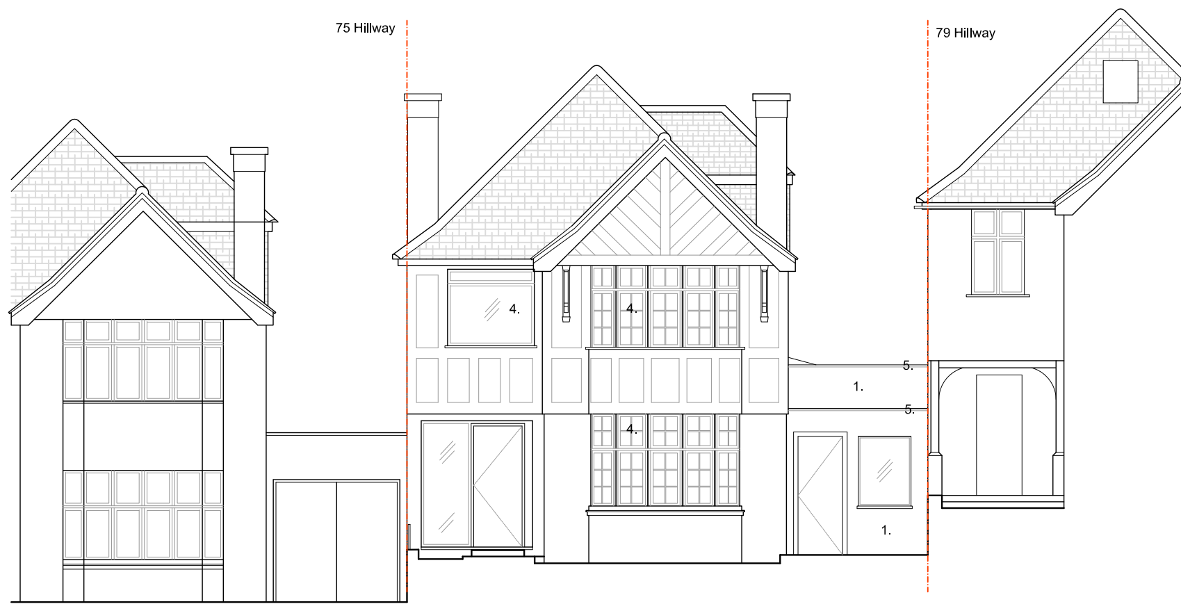
FRONT ELEVATION 1 1:100 @ A3 HIW - 301