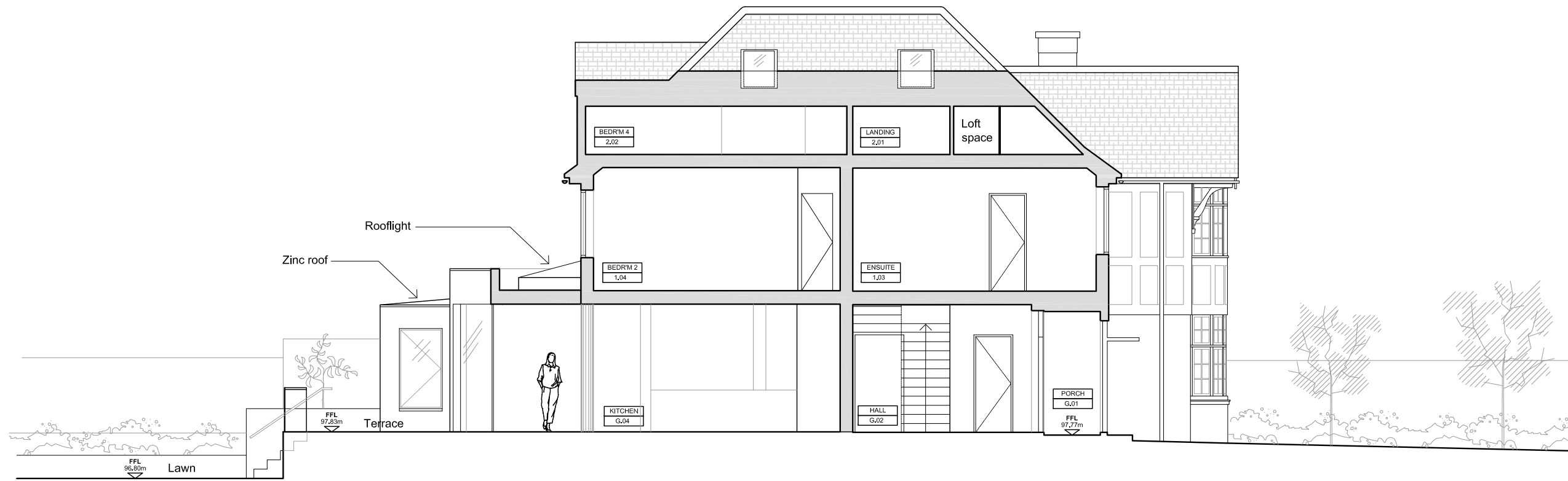
SECTION C - C 1 1:100 HIW-200