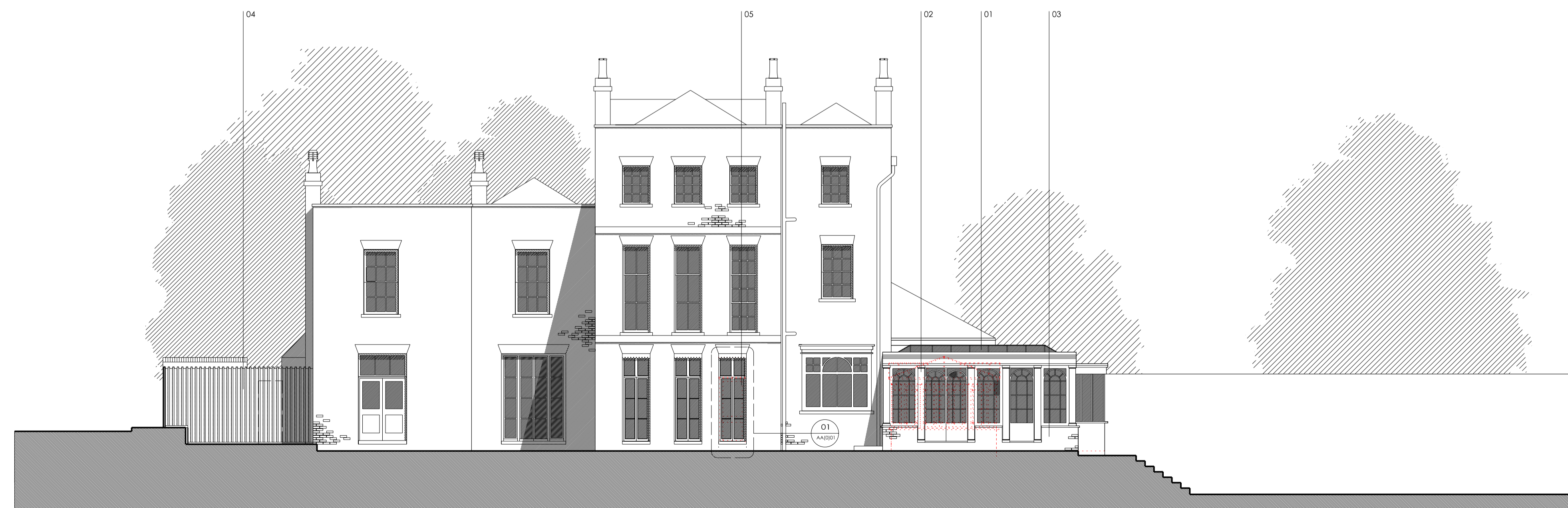
EXISTING SOUTH-WEST ELEVATION