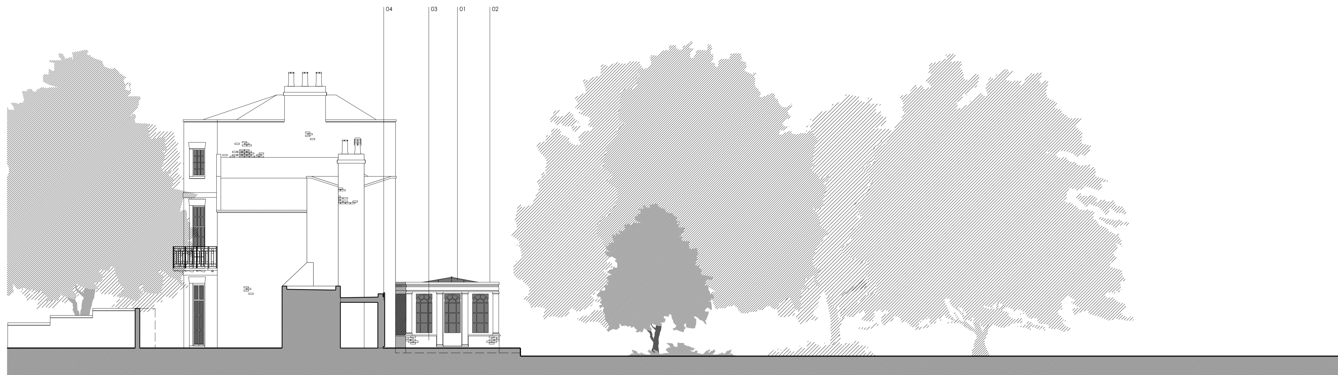
EXISTING NORTH-WEST ELEVATION

KEY TO MATERIALS 01 - Glazed roof with timber spacer bars 02 - Timber framed orangery with timber and glazed doors and windows 03 - Brick plinth to match existing brickwork of house 04 - Lightweight timber structure forming new garden room store to be clad in timber 05 - New timber framed glazed doors to match adjacent existing