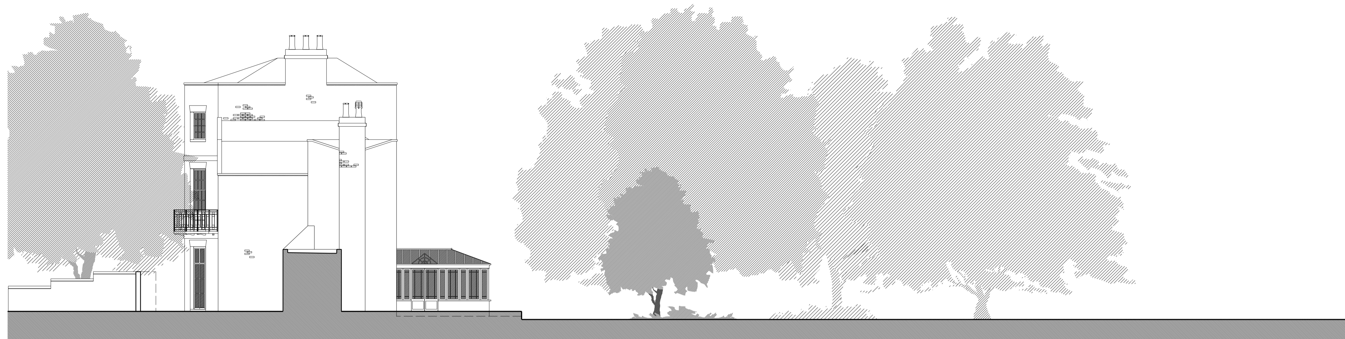
EXISTING NORTH-WEST ELEVATION