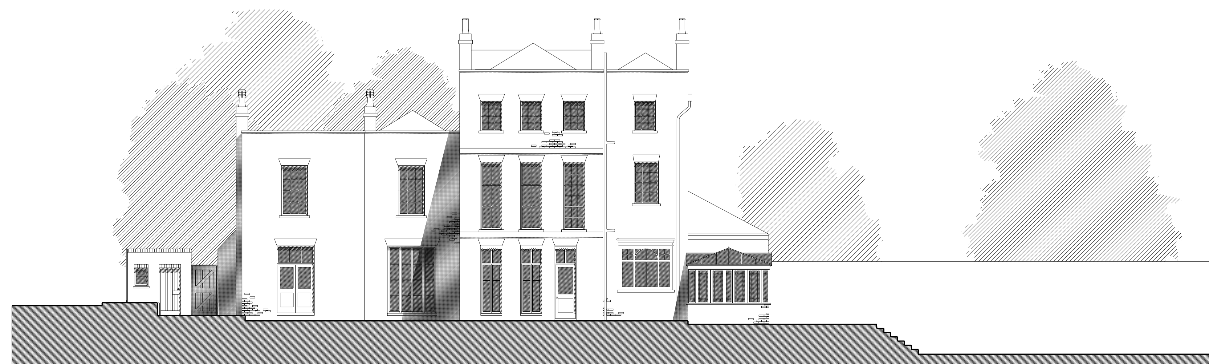
EXISTING SOUTH-WEST ELEVATION