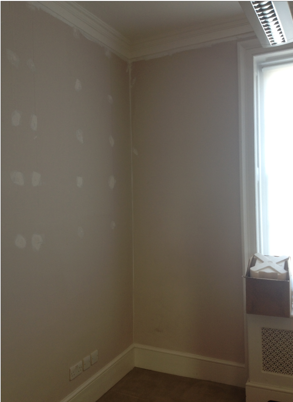
Photograph of corner at second floor level where riser will be chased.