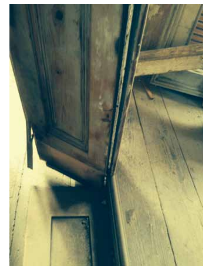
Photos of all existing timber frames and skirting some of which is in poor condition