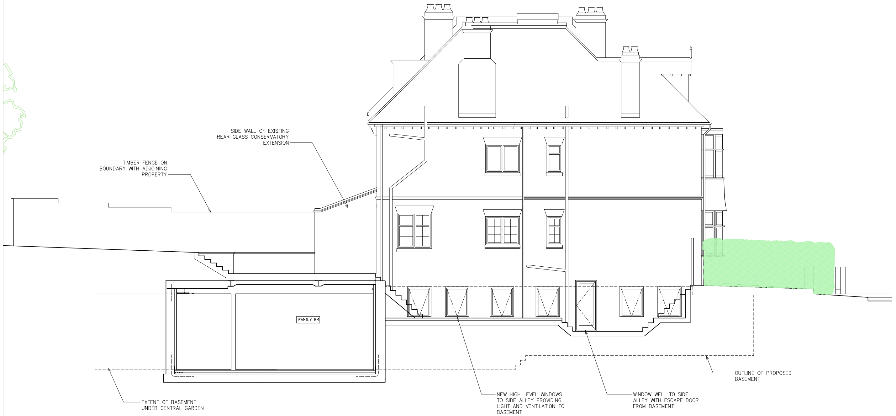
1 PROPOSED SIDE ELEVATION 1 : 100

USE FIGURED DIMENSIONS ONLY. DO NOT SCALE FROM THIS DRAWING. ALL DIMENSIONS MUJST BE CHECKED ON SITE & ANY INCONSISTENCIES MUST BE REPORTED BACK TO THE ARCHITECT. THIS DRAWING AND ANY DESIGNS INDICATED THEREON ARE THE COPYRIGHT OF THE ARCHITECT. ALL RIGHTS ARE RESERVED. NO PART OF THIS WORK MAY BE REPRODUCED WITHOUT PRIOR PERMISSION IN WRITING FROM THE ARCHITECT.