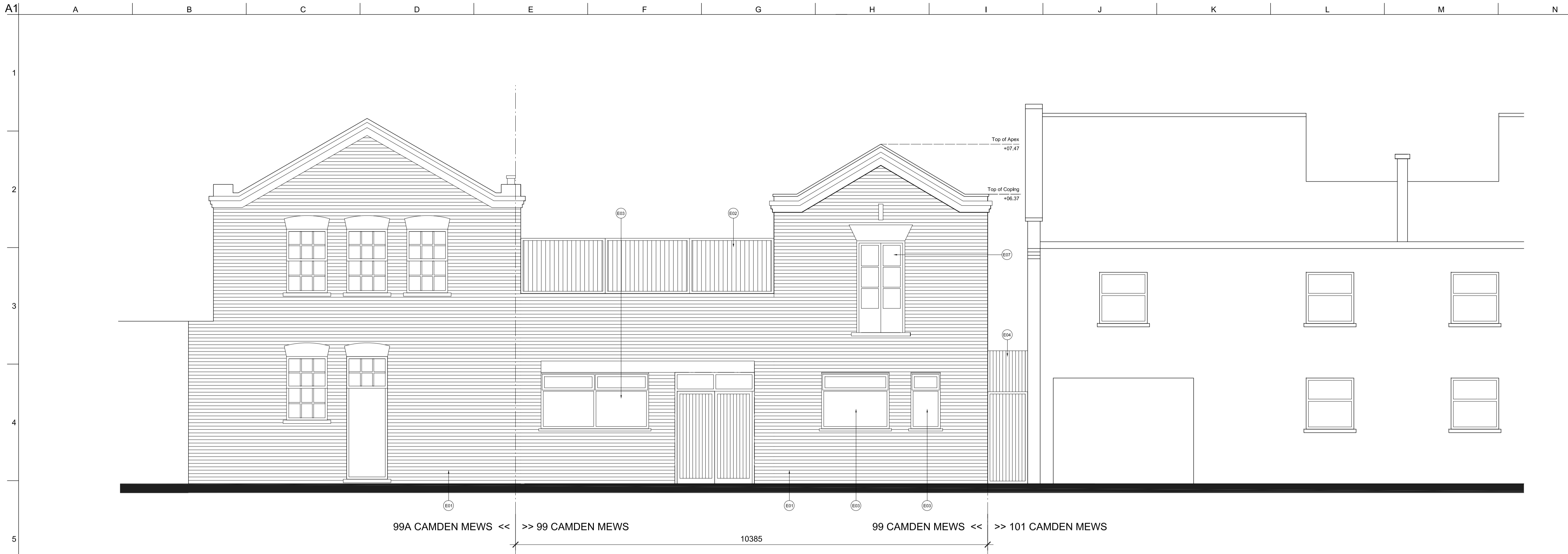
1 FRONT ELEVATION 1:50