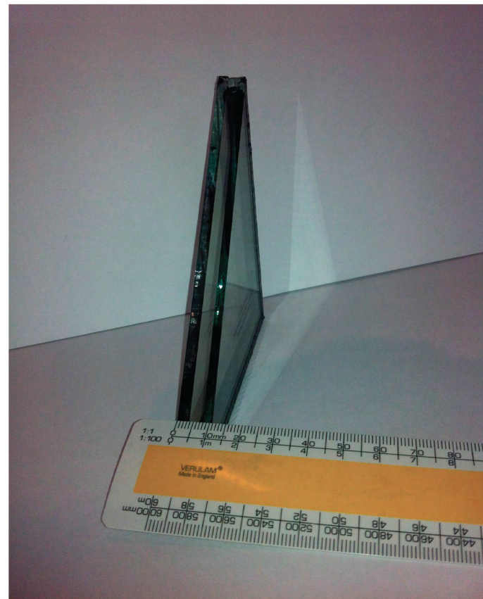
SAMPLE PHOTOGRAPH SCALE 1 - 1

Slimline double glazed units of an overall thickness of 11mm