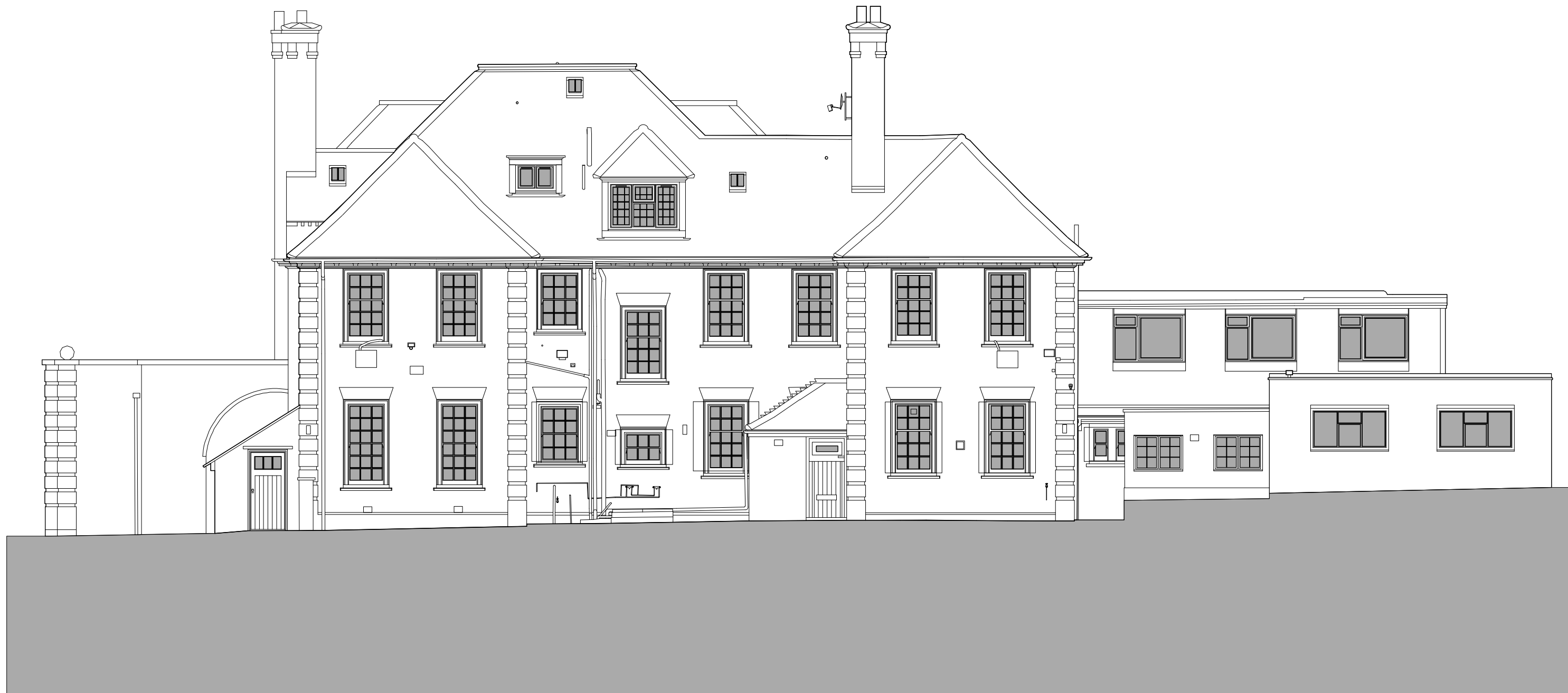
A Existing Rear Elevation General arrangement PL.03 1/50@A1_1/100@A3

Information contained within this drawing is the sole copyright of 21st Architecture Ltd. and is not to be reproduced without express permission. No implied licence exists. This drawing not to be used for land transfer or valuation purposes. Do not scale from this drawing. All dimensions & levels are to be checked on site by the contractor. Issued for purposes indicated only. Drawing errors and omissions to be reported to the architect.