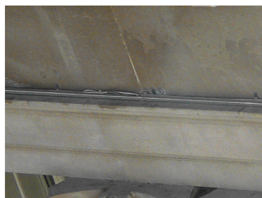
LEAD TAB FIXINGS FOR LED LIGHT AND CABLE