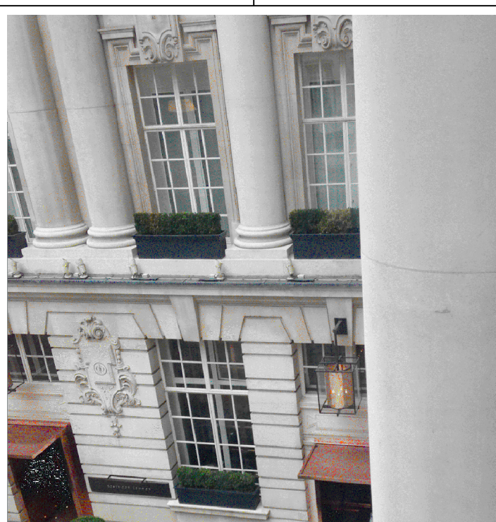
EXISTING LEAD TAB CABLE FIXINGS AND LIGHTING FITTING MOUNTING PLATE RE-USED